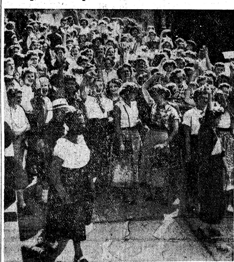
Disgusted with American Telephone & Telegraph Co. stalling in negotiations, 2,000 long-lines workers attended a one-day "continuous protest meeting" in Chicago.

The flare-up of large strikes in the telephone and rubber industries has subsided with the signing of union contracts granting wage increases and other benefits.