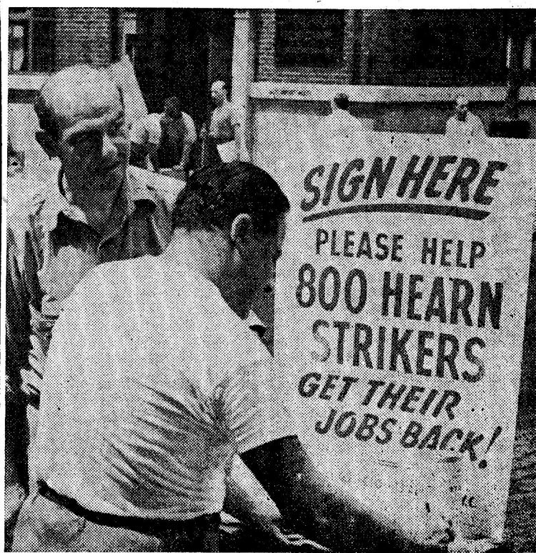
Over 150,000 New Yorkers have signed petitions calling on Hearn's Department Stores to settle the strike called May 14 by Dist. 65, Distributive Processing & Office Workers (CIO). Above, a union member gets another signature on lower Broadway. Mass picketing was barred by a court order.