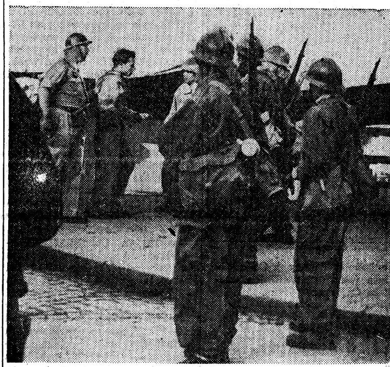
Young Arab, second from left, was arrested and searched for arms by Moroccan troops patrolling streets of Rabat, capital city. Troops tried to curb disorders which followed installation of French-backed Sidi Mohammed Moulay Ben Arafa as new sultan, succeeding deposed Sidi Mohammed Ben Youssef.