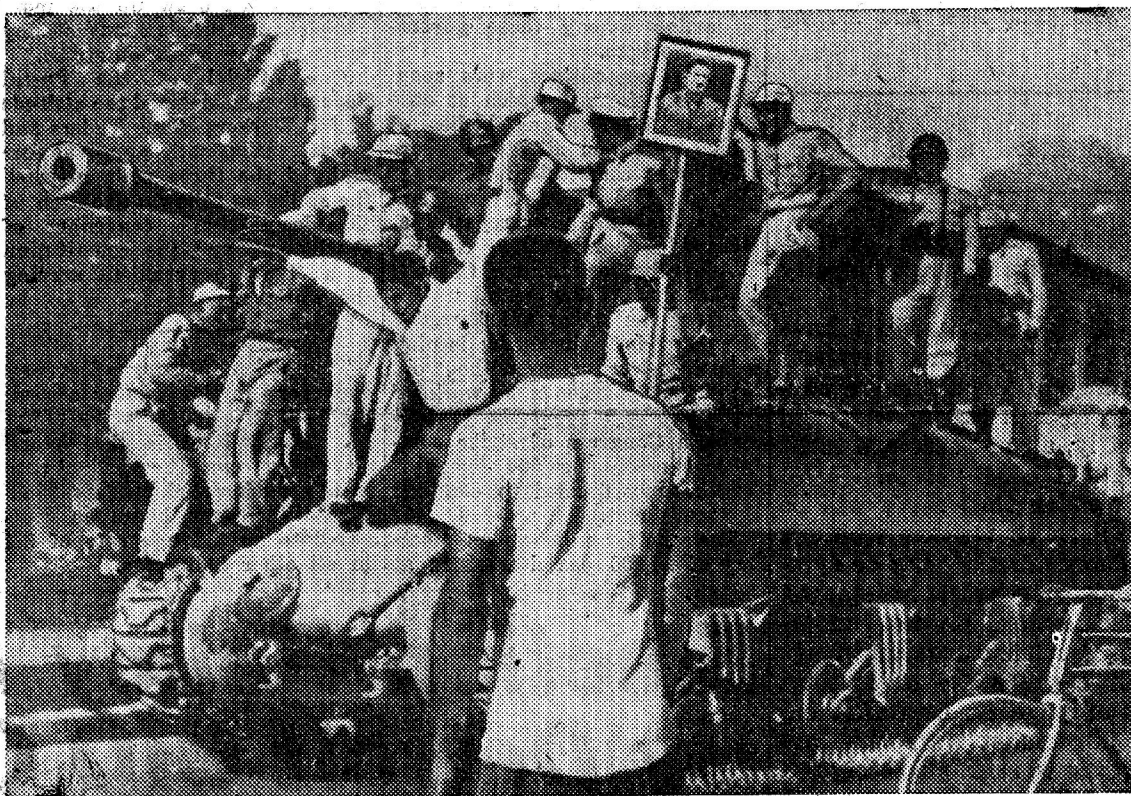
Pro-royalist troops stage triumphant parade through streets of Teheran following overthrow of Iranian Premier Mohammed Mossadegh, paving way for return of recently exiled young monarch, Shah Riza Pahlavi. Shah's picture is carried on tank. The monarchist coup caused rejoicing in Big Business circles in the U.S. and Great Britain. They expect to regain their grip on the oil industry which was expropriated under Mossadegh.