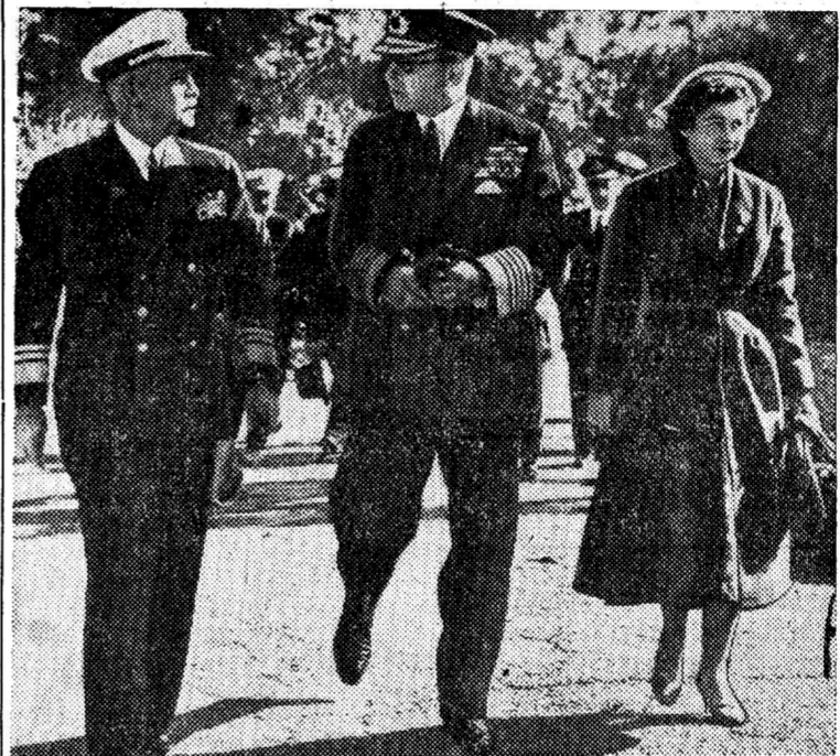
Heir to the bloody Glucksberg dynasty, King Paul of Greece (center), in admiral's uniform, and his spouse Queen Frederika, shown with Adm. C. Turner Joy at the Naval Academy at Annapolis on their current U.S. show-tour. Her majesty, German-born, was an ardent supporter of Hitler, a fact slicked over by the American capitalist press and government.