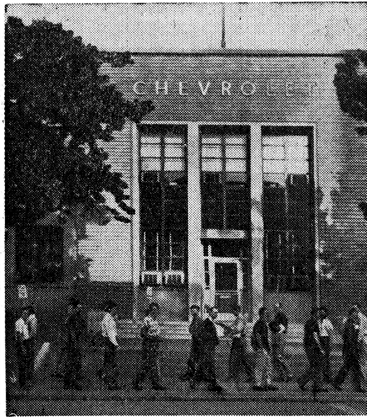
Pictured above are some of the 4,000 Baltimore GM workers who struck last June in protest against failure of new contract to satisfy their grievances. Thousands of other Ford and GM workers did the same during their contract negotiations. Now Studebaker workers have shut down the company's South Bend, Ind., plant to enforce contract layoff provisions. (See story this page.)