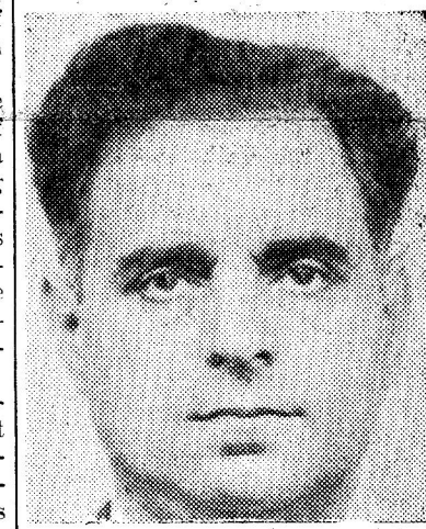
AHMED BALAFREJ, Secretary-General of the Istiqlal (Independence) Party of French Morocco. Driven underground, like all nationalist movements that preceded it, by the French imperialists in 1944, it carries on agitation for freedom and political rights for the 9 million people of Morocco.

an inch. They want their privileges left intact.