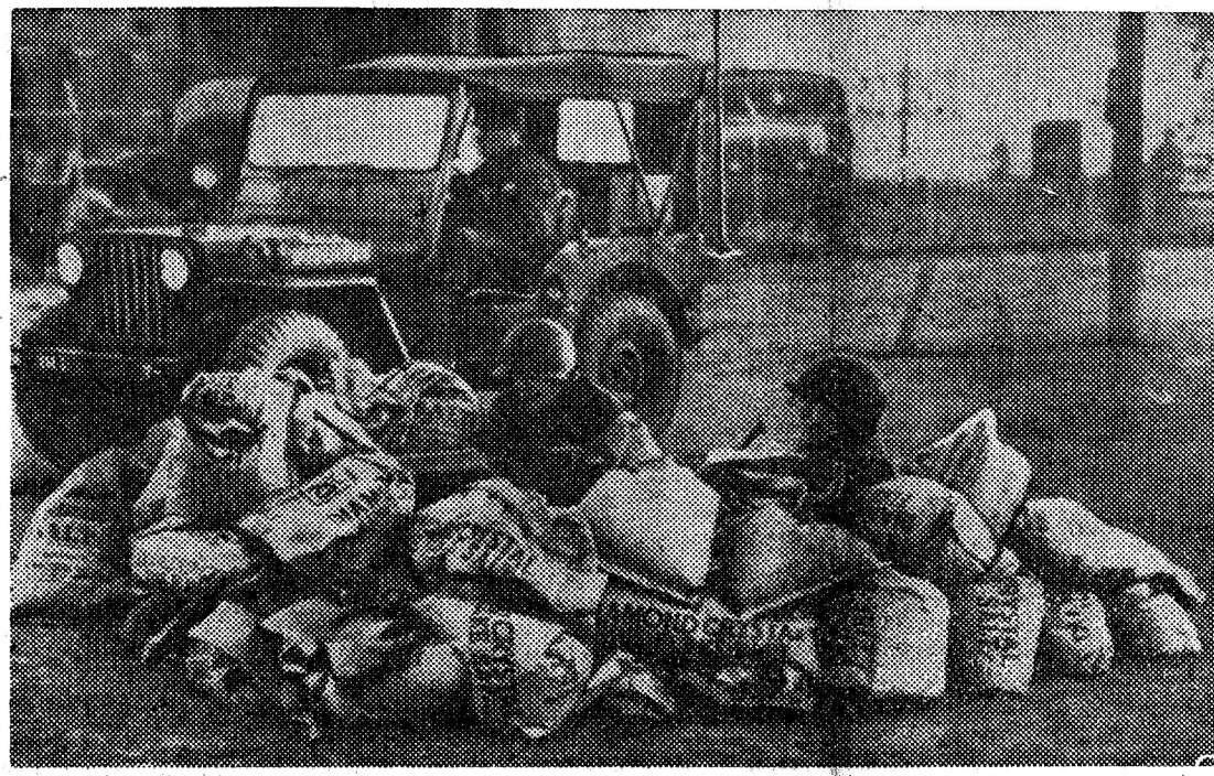
National guardsmen man the foxholes at Perfect Circle plant gates. Machine guns were to be used against pickets to allow free entree of scabs into the strike bound plant.