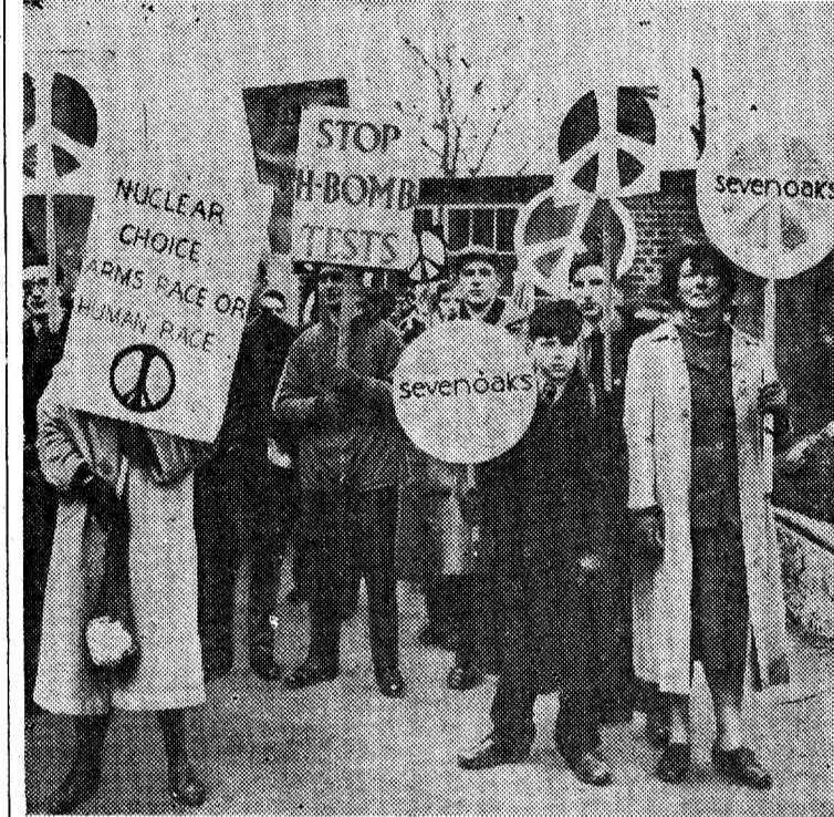
Demonstrating against British nuclear-arms build up, pacifists staged a London prison-to-prison parade Jan. 27. They marched from the prison where male members of the group are being held on charges of "disturbing peace" to prison where female members are jailed on the same charge.