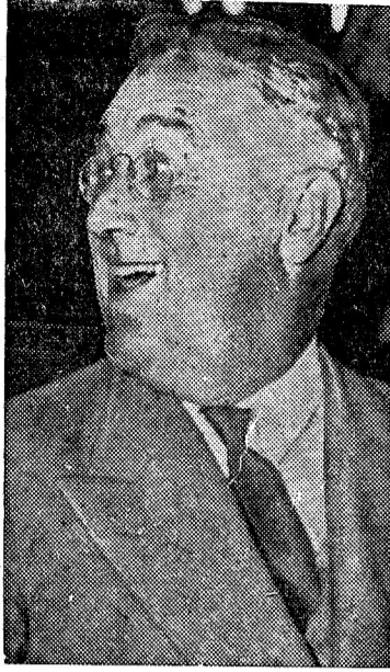
Carefully cultivated legend presents the late Franklin D. Roosevelt as a champion of civil liberties. But the FBI enjoyed its greatest period of expansion under his administration.

the FBI's budget amounts to $102,500,000. There are now 14,000 FBI employees; 6,000 agents and 8,000 clerks distributed through 53 field offices, with an operating fleet of 3,104 passenger cars. Each field division is equipped with a radio-telephone system for communication with their vehicles.