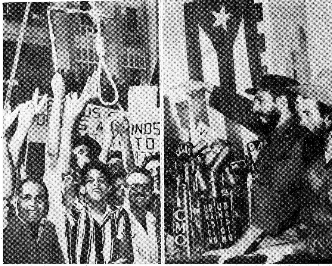
More than half a million Cubans massed in Havana Jan. 26 demonstrating approval of trials of Batista gunmen. One man held rifle aloft as symbol of the penalty earned by torturers and assassins. Fidel Castro told rally that protests in Washington against executions were "infamous."