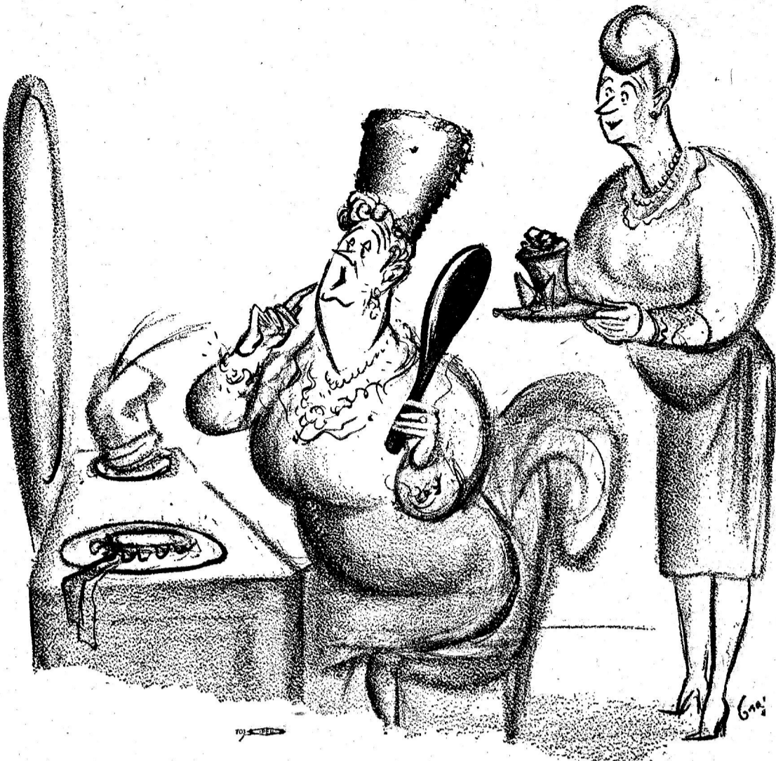
"Very becoming — but the Russians thought Mr. Macmillan looked just awful in it."

First of all, why should unions agree to "stand still" at prevailing wages while they demand a shorter work-week to take care of the unemployed? Certainly not for the reason that Hoffa suggests; that "employers" couldn't afford a wage increase after reducing hours. The capitalist class has been squeezing huge extra profits out of workers on a 40-hour week. They do it through automation, other technological advances and murderous speed-up. Secondly, to "stand still" in the face of continuing inflation means taking a wage cut. Many unions have already adopted and partially won the demand for an escalator clause as an answer to this problem. Thirdly, there are millions of unorganized workers in this country whose wages must be brought up to standard if for no other reason than to safeguard the union scale. The unions can't "stand still" to do that. They have to press ahead. Defense of the standard of living has always meant an all-sided struggle to raise wages, shorten hours, improve conditions, and organize the unorganized. With a "hard core" of permanent unemployment now reappearing in America, this struggle has become more important than ever.