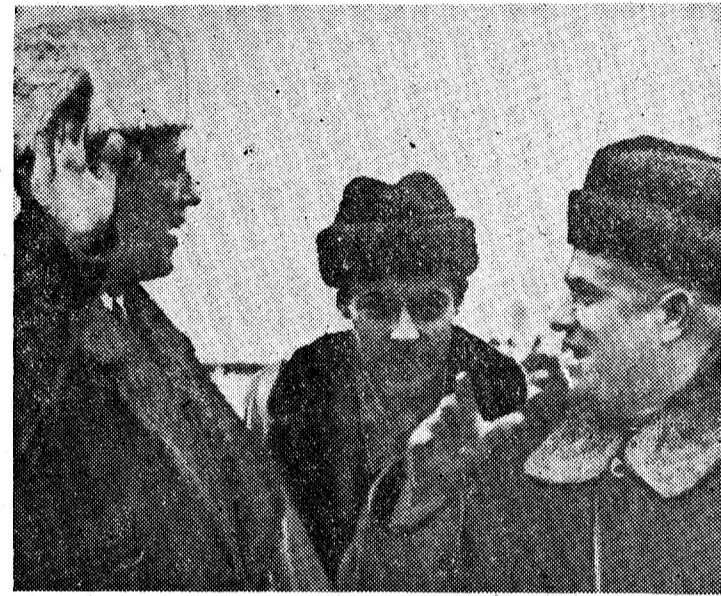
British Prime Minister Macmillan (left) holds animated conversation with Soviet Premier Khrushchev during recent discussion over Berlin crisis.