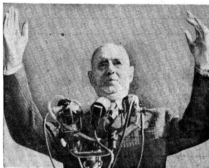
French Bonapartist Gen. Charles de Gaulle in a Feb. 24 speech at town hall square in Perpignan sternly tells people of sacrifices they will have to make in their living standards to restore "grandeur" of France. His program to put the burden of the crisis of French capitalism on backs of the workers is creating growing dissatisfaction.

class cannot fight for its most immediate and urgent needs without coming into collision with the labor bureaucracy. The fight for a shorter work-week at no reduction in pay, which is a fight against the general lowering of living standards through the creation of a permanent army of unemployed; the fight for civil rights, which is the fight to forge an alliance between the labor movement and the Negro people; the fight against intolerable speed-up of the production lines, which becomes even more intolerable as the number of layoffs increase—all these are political fights under the conditions of modern capitalist America. They require a political program of struggle; they demand the political organization of labor and its allies; they require the complete independence of labor from the capitalist government and parties. And, yes, they require above all the freeing of the unbound energy and initiative of the working class which can be brought about only through a democratic reconstruction of the unions.