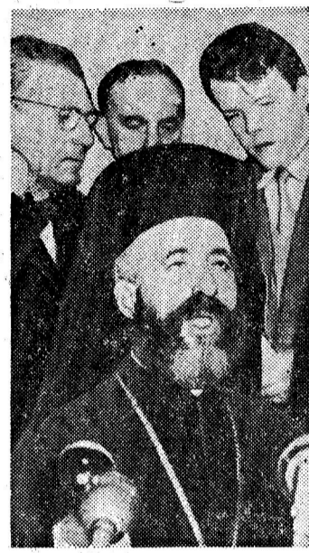
Archbishop Makarios returns to Cyprus after Britain, Greece, Turkey made island a republic. British exiled him for advocating union with Greece.