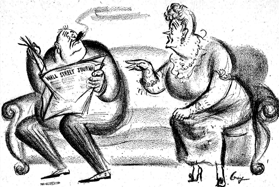
"I was sure anyone who could answer those quiz questions must be a Communist. But he didn't take the Fifth Amendment!"

The Northern agencies of capitalist propaganda aren't as blatant about their racism as those in the South. But they're just as sickening.