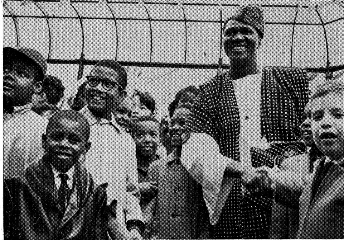
A group of students from Public School 129 in New York got a pleasant surprise when they were on a sightseeing tour of the Empire State Building. Also visiting the famed structure was Sekou Toure, president of the newly independent state of Guinea. The children were obviously delighted to pose for photographers with the man who led his country in wresting freedom from French imperialism. Toure, who was here on a good-will tour, challenged the United Nations to take a stand for African freedom. (See story page 4.)