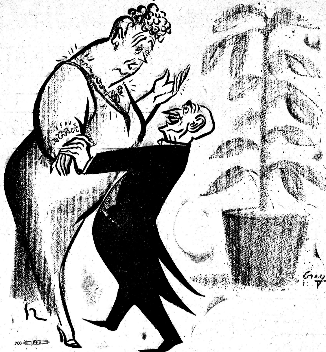
"Roll out a red carpet? Of all people, you'd think General Franco would have sense enough to choose a free-world color for the President's visit!"

It appears clear to us — as it did also to the National Guardian (see its Dec. 7 issue) — that Fred Cook and the Nation are the victims of a dirty move to discredit their indictment of New York rackets, politics and big business. The indictment thereby becomes all the more pertinent. We recommend that our readers obtain and circulate the Nation's special issue. They can do so by sending 50 cents to the Nation, 333 Sixth Ave., New York 14. Ten copies are $4 and 50 copies $7.50.