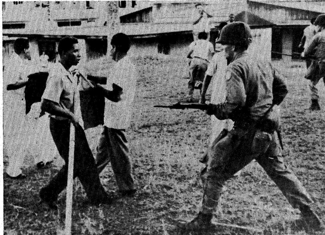
This scene, taken during a demonstration Nov. 29 in the Canal Zone, looks almost like a tableau of rich, powerful America and the poverty-stricken, insurgent colonial people of the world. The unarmed youth is seeking to raise the flag of Panama on soil that belongs to his country, although it was leased under duress to the United States in "perpetuity."