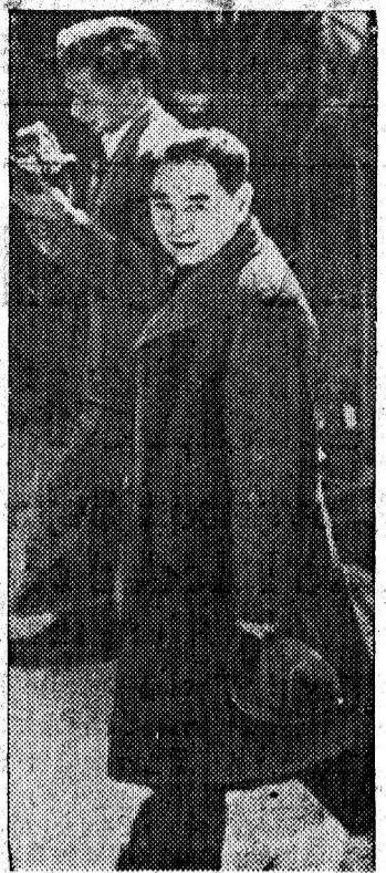
Premier Chou En-lai of the People's Republic of China devoted more than a third of his economic report Aug. 30 to a rebuttal of the criticisms of the "right opportunists." In the report to the Standing Committee of the Second National People's Congress he defended the official position on the communes and the "great leap forward."

The evidence also indicates that what is taking place is not a mere power struggle but a fight over economic policy stemming from different appraisals of economic results. In dispute are (1) the rural people's communes and the community dining halls — that is, the CP's current policies toward the peasants; (2) the "great leap forward" — that is, the economic tempos adopted by the CP at the end of 1957 and sustained ever since; (3) such specific "leap forward" projects as the small-scale iron and steel furnaces set up all over the country last year; (4) overall conceptions of economic planning.