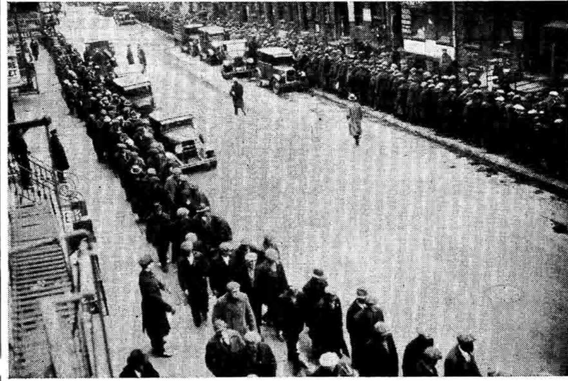
If you're still in your teens or early 20's, America's Great Depression is something you've heard or read about. But for millions of workers a line of hungry jobless like this one is a scene they'll never forget. With current signs pointing to a new recession a lot of people are asking, "Will It Happen Again?" The ultimate answer depends on how soon the American working people take over our vast productive machine and start operating it for use instead of profit.