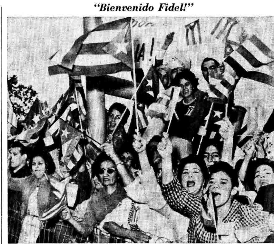
Part of the crowd of several thousand New York supporters of the Cuban Revolution who went to Idlewild Airport Sept. 18 to extend a rousing welcome to Premier Castro. One huge banner declared: "Welcome Fidel — Give 'Em Hell!"