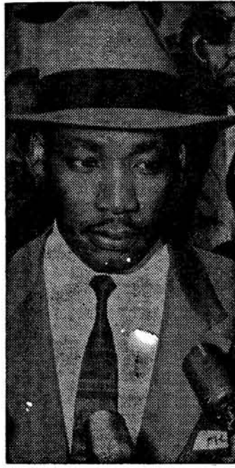
Martin Luther King

Albany Movement leaders have signed property bonds for about 25 remaining prisoners, virtually clearing the jails of civil-rights prisoners after 418 arrests since the current wave of protests began July 11. City officials faced a severe financial crisis from the expense of the mass jailings. The suspension of the big demonstrations, together with the bailing out of the prisoners, takes some of the pressure off. But Negro leaders have declared that the mass demonstrations will be resumed if the city continues to enforce local segregation ordinances.