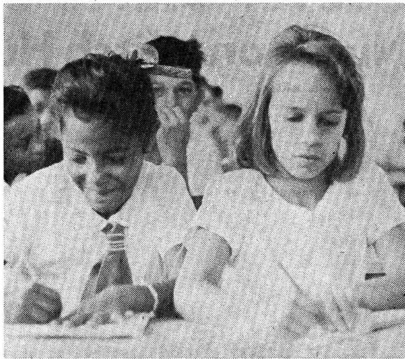
Everything for Cuba's Children is the philosophy of the Revolution in that country. Shown above are children in a new model school at the Hermanos Sainz co-operative. Under Castro, Cuba spends proportionately five times as much as the rest of Latin America for education.

In the stores, American items of daily use like soap, razor blades, toothpaste, beauty products, etc., have been replaced by Cuban products of "mediocre quality." The supermarkets are still called