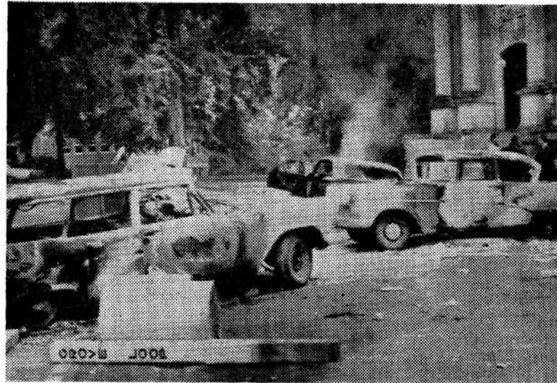
THE MORNING AFTER THE RIOT in Oxford, Miss., where enraged white supremacists vainly tried to prevent the registration of James Meredith, the first Negro to enter the University of Mississippi. Cars destroyed by the rioters are shown above still smoldering. Two persons, one a French newsman, were killed and over 75 injured.