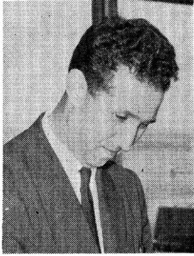
Mohammed Ben Bella

been made, hunger and distress are widespread. A symptomatic reaction has been a rise in "requisitions" carried out by undisciplined military contingents and of outright stealing.