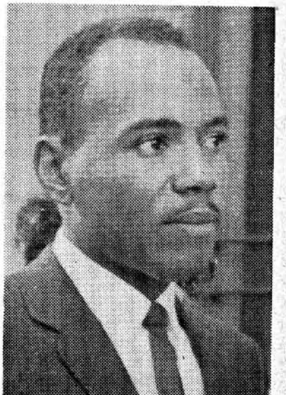
James H. Meredith

Where does Meredith's iron de- (Continued on Page 6)