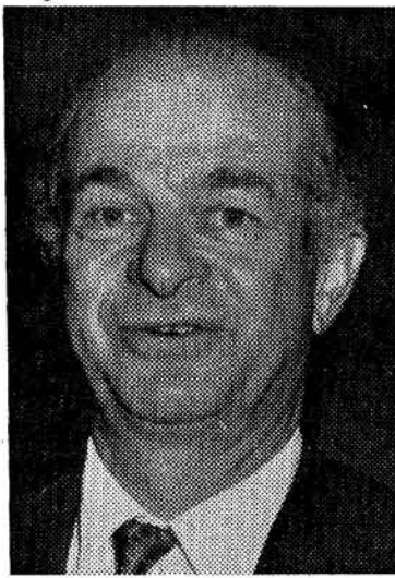
Dr. Linus Pauling

The telegram went on to term Kennedy's action a "war-like" one which "labels our nation recklessly militaristic." Dr. Pauling urged the president to rescind his "orders and threats" and to devote his energies to seeking solutions to world problems in the UN.