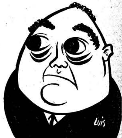
J. Edgar Hoover

if this type of apple-polishing isn't sickening enough, agents are also advised not to forget J. Edgar's birthday. A happy-birth-