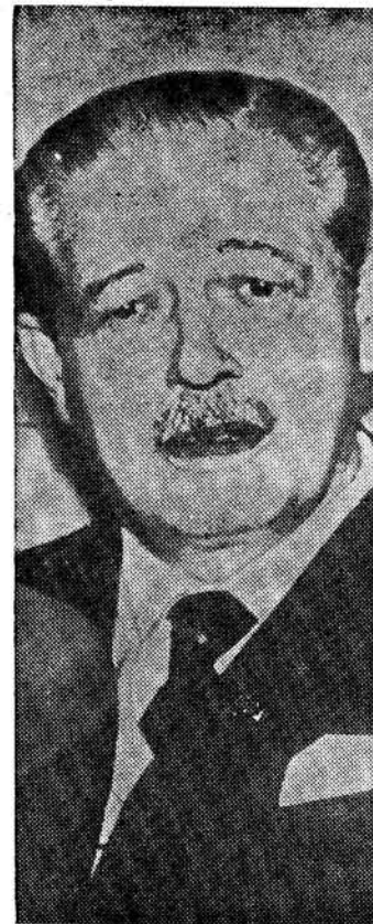
Prime Minister Macmillan