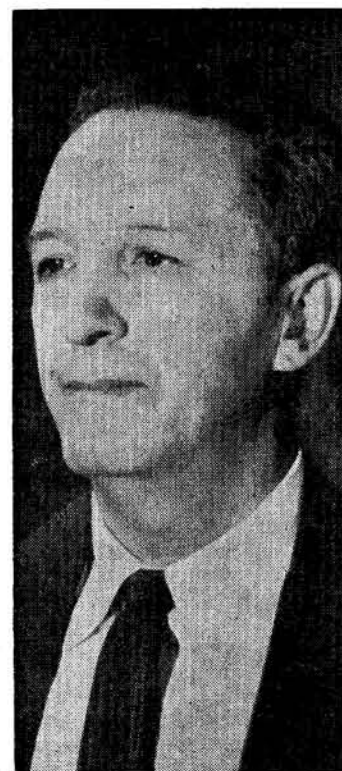
FARRELL DOBBS, National Secretary of the Socialist Workers Party.

capitalism they also put an end to exploitation of their country by American monopoly corporations. In putting human welfare above corporate profits, the Cuban revolutionists committed an unpardonable sin in the eyes of the capitalist rulers of the United States. If the Cubans aren't stopped, workers in other Latin American countries will begin to follow their example and the idea that the workers should run national affairs will make headway here in this country. To prevent that for-