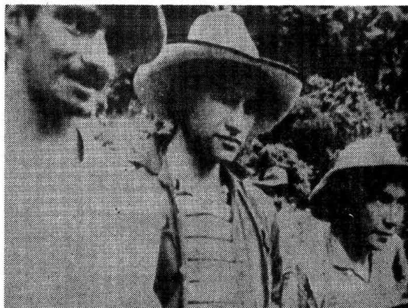
PEASANT LEADERS. Hugo Blanco, center, before his arrest, with fellow fighters against rapacious Peruvian land barons.

[The following letter was written by Hugo Blanco, main peasant leader in the Convención valley of Peru, from his cell in the Mariscal Gamarra barracks at Arequipa. In his letter Hugo Blanco appeals for contributions to help his legal defense. Due to communication difficulties, we are unable to specify an address to which funds can be sent. We hope to provide this in an early issue.]