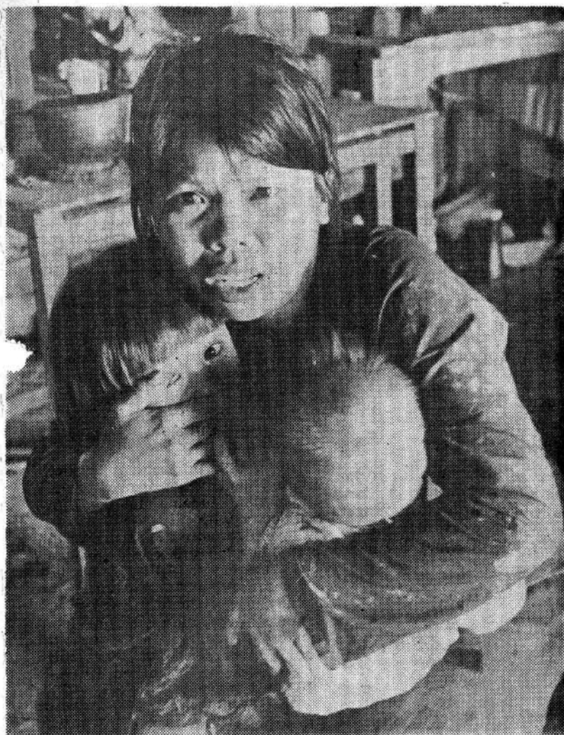
"ENEMIES"? South Vietnamese peasant grips her children in fear as government soldiers invade her hut to grill her about her husband who they suspect is a guerrilla supporter.

From farmhouse to farmhouse, the peasants signalled with lamps, reporting our advance. Shortly before dawn we met another Ranger company. Nobody had found any guerrillas."