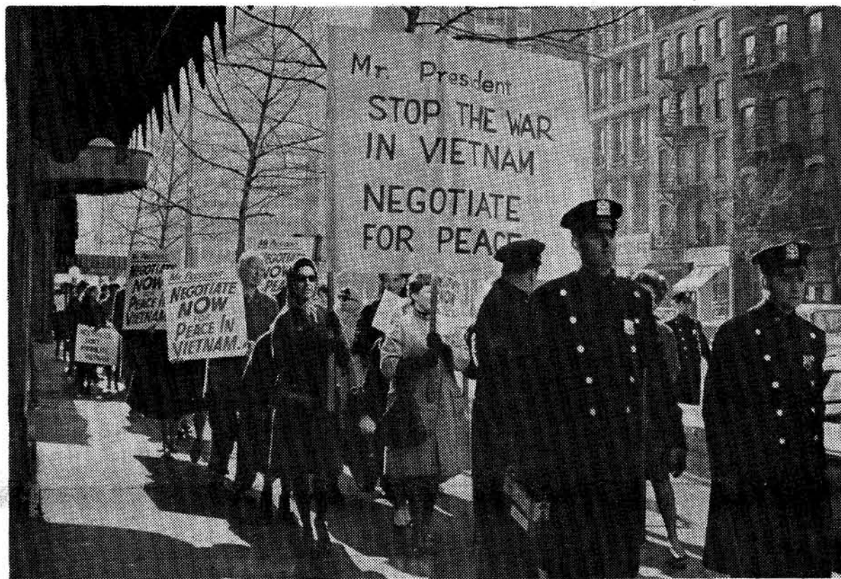
NEW YORK DEMONSTRATION. Several thousand New Yorkers answered Women Strike for Peace call for anti-Vietnam-war demonstration at UN Feb 13. Then contingent of demonstrators marched to Soviet, British and French UN missions to present call for negotiations on issue.

"Saigon NO! Selma SI!" was (Continued on Page 6)