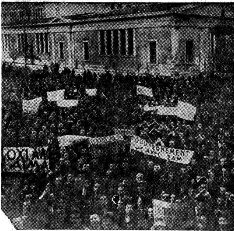
ATHENS, 1947. Workers demonstrated outside Acropolis Hotel where United Nations Inquiry Commission stayed, during Greek civil war. Among the banners was one which read: "British Troops Must Leave Greece." While the Commission held hearings, the Greek government executed its political opponents. Current demonstrations are renewal of those struggles.