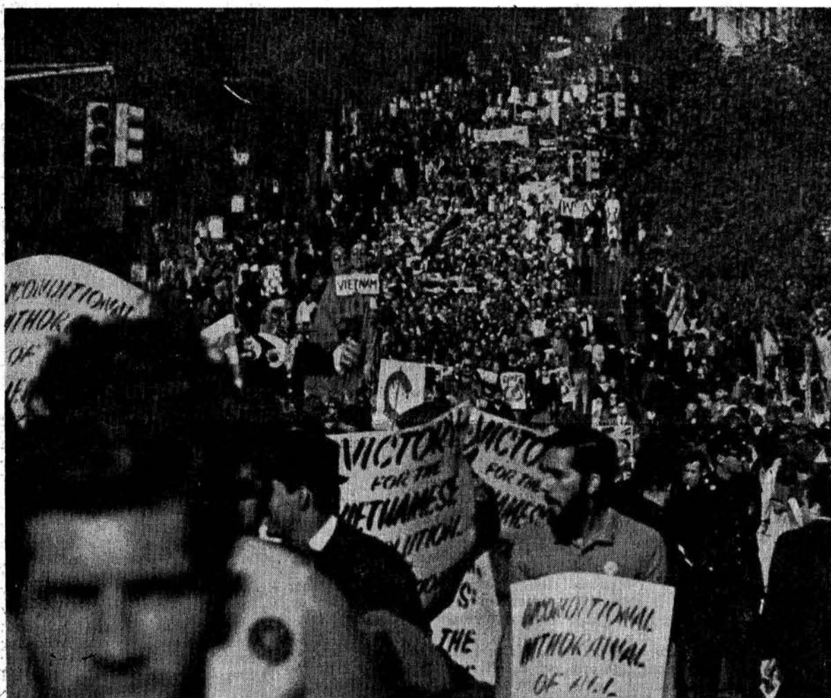
NEW YORK PARADE. Scene along mile-long parade route down Fifth Avenue in New York. When first contingent reached end of route thousands were still waiting to begin march. Official slogan of the parade, which was carried by most marchers, was "Stop the War in Vietnam Now."