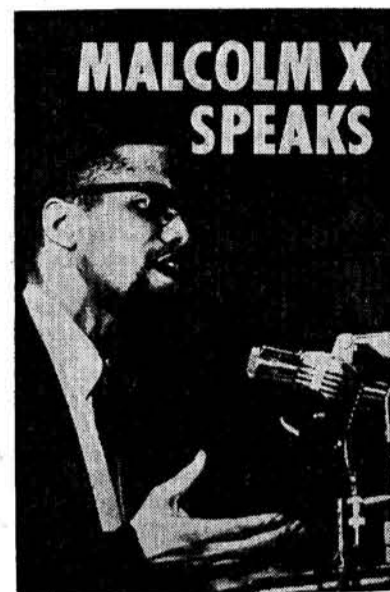
Excerpted from the book, Malcolm X Speaks , with the permission of Merit Publishers, 5 East Third St., New York, N.Y. 10003. Price $5.95. Copyright 1965 by Merit Publishers.

In Bandung back in, I think, 1954, was the first unity meeting in centuries of black people. And once you study what happened at