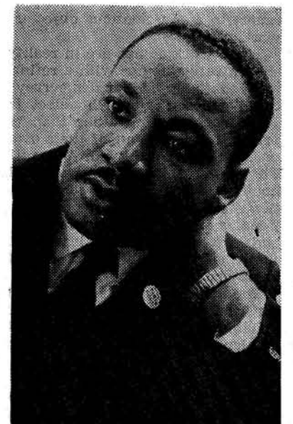
Rev. M. L. King

It is a very encouraging sign that SNCC has not bent to this pressure. Black people will win freedom, justice and equality by fighting the rulers of this society who maintain racism, not by attending phoney conferences organized by the racist rulers.