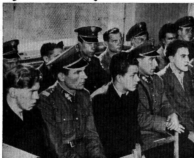
ON TRIAL. Group of youthful defendants seated between policemen in trial that followed Poznan uprising. Continuing mass ferment forced government to free all but three of 154 accused.

On Oct. 19, rejecting an ultimatum from Khrushchev, the Polish CP tops decided to install a new party leadership not hand-picked by the Kremlin. Khrushchev and a delegation flew in from Moscow. Soviet occupation troops began to encircle Warsaw. But the Poles stood firm. Gomulka let it be known to the world that if the Red Army moved in, he would call on the entire Polish people to rise. Huge meetings of workers and students made it clear that the people were ready to respond to such a call. The Russian bosses retreated. Khrushchev and