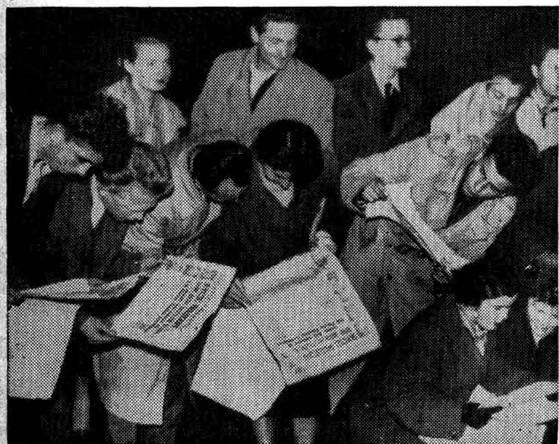
OCTOBER DAYS. Polish students gather to read latest news bulletins during turbulent October, 1956, Polish revolt against Kremlin domination.