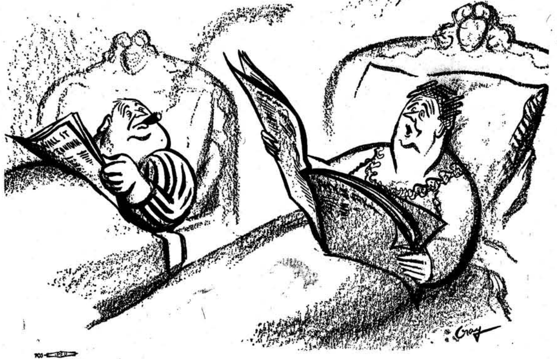
I don't see why you're so neurotic about the Communist Party, dear. The Times says they're against that Judy White too.

Anyone who has heard the SWP candidates on radio or TV, or read its election literature, knows that the SWP places the responsibility for the perilous world situation squarely on the doorstep of U.S. imperialism. Every politically informed person also knows that the SWP vigorously and unconditionally defends the USSR, China,