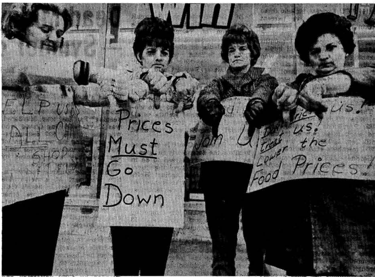
THUMBS DOWN ON HIGH PRICES. Housewives picketing supermarket in Levittown, Pa., express their view of price-gouging food chains. Determined housewives all over are boycotting and picketing supermarkets to force them to reduce prices. See story page 2.