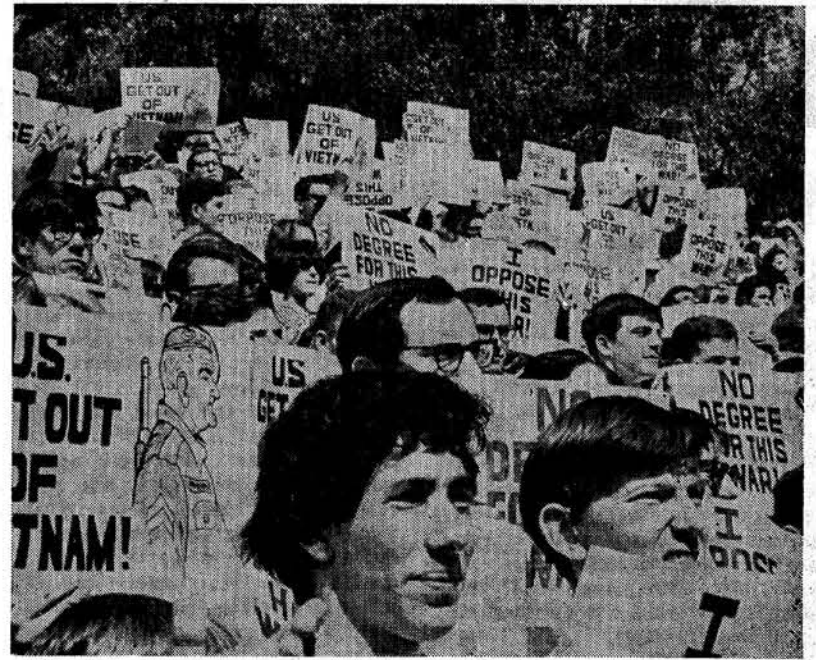
ANTIWAR DEMONSTRATION. Scene at Berkeley campus last spring when UN Ambassador Goldberg was greeted by opponents of Vietnam war.

On Nov. 9, Mario Savio was denied re-admission to the uni-