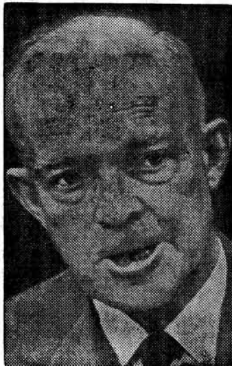
General Eisenhower Advises Peace Movement

The essence of the statement is pure political reaction veneered with transparently fake liberalism. Its principal concern, the sponsors