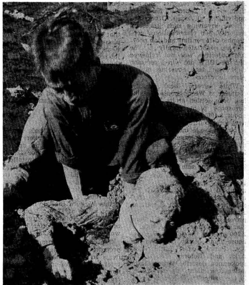
MILITARY TARGET? Rescuers dig out two children after U.S. bombs brought down their school at Thai-binh in North Vietnam on Oct. 21. Forty persons were reported killed, including 30 students from 13 to 16 years old, a woman teacher and two pregnant women. Six others, including four pupils, were wounded.

Four teams of "rural-development" workers, who are supposed