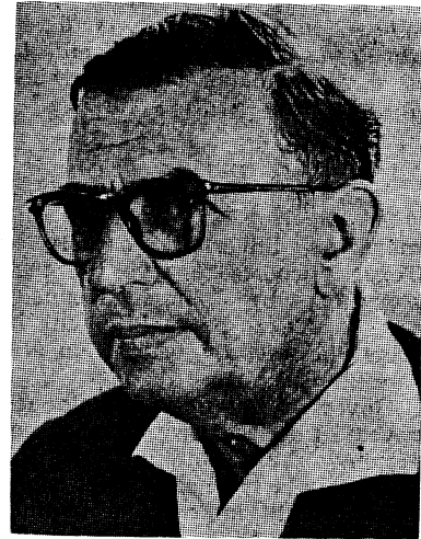
JEAN PAUL SARTRE. He was on Tribunal.

In response to invitations from the tribunal, the National Liberation Front and the government of the Democratic Republic of Vietnam cooperated with the investigation, making it possible for experts to move freely in the areas