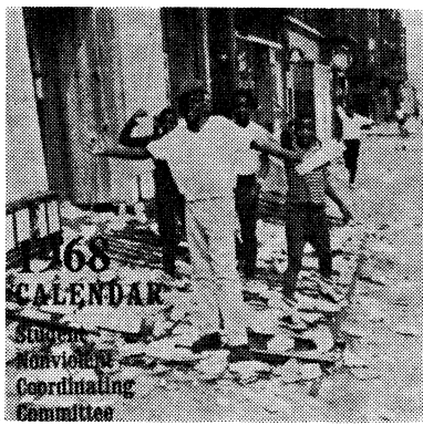
CALENDAR. Posters, photos, etc. are available from SNCC.