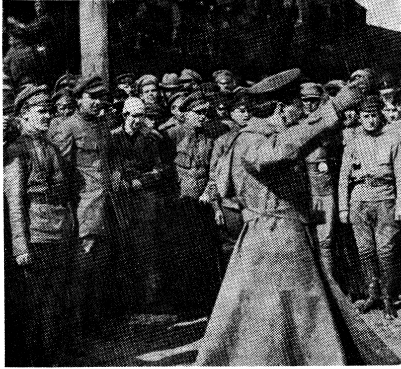
TROTSKY. Commissar of War addressing Red Army soldiers in 1920.

the contrast: workers, peasants and soldiers with the Bolsheviks; intelligentsia, petty-bourgeoisie, the military brass with Kerensky.