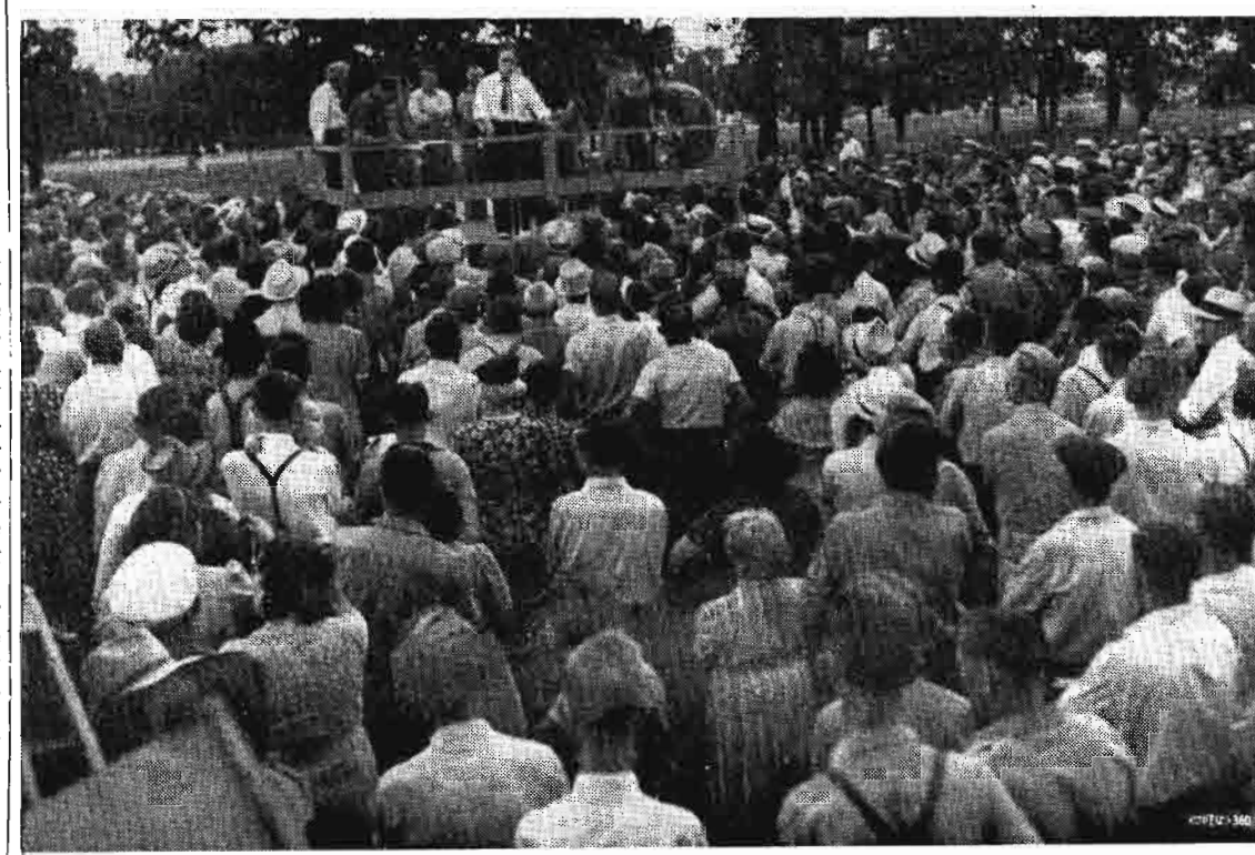
One of the mass meetings held by W.P.A. strikers in the Minneapolis Parade Grounds with 5,000 workers present. Speakers representing the Building Trades Unions, Local 544's Federal Workers' Section, the C.I.O. and the Workers Alliance told the assembled workers that the fight of the Building Trades is the fight of American labor.