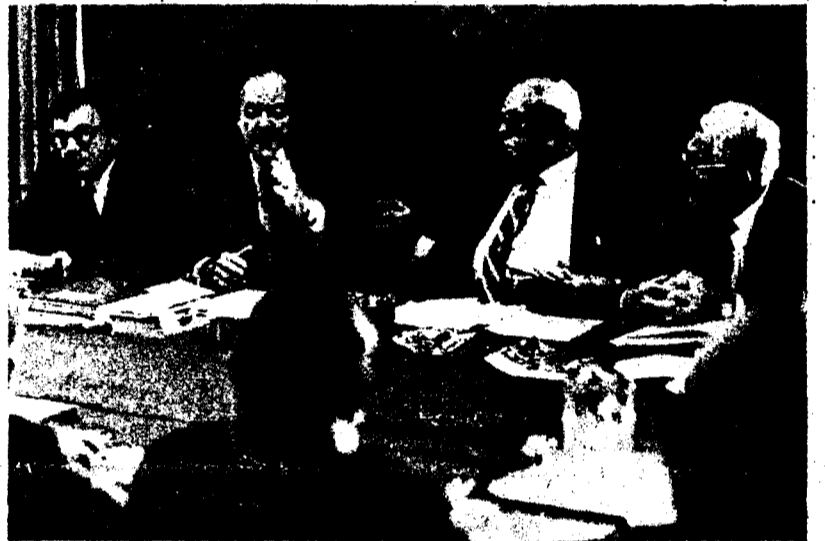
LABOR BUREAUCRATS MAKE DEAL WITH "LESSER EVIL". Left to right: Secretary of the Treasury Lane Kirkland, Hubert Humphrey, AFL-CIO President George Meany, Steelworkers' I.W. Abel.