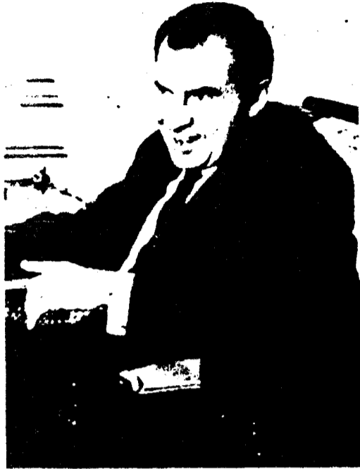
NIXON crushes strikes and calls for more "productivity" as unemployment soars.