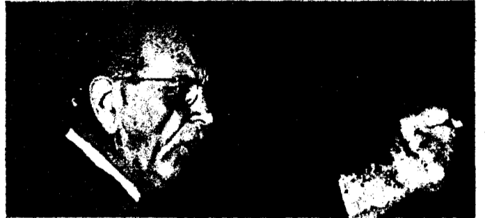
LBJ widened war which accelerated inflation while he rigorously put down strikes.