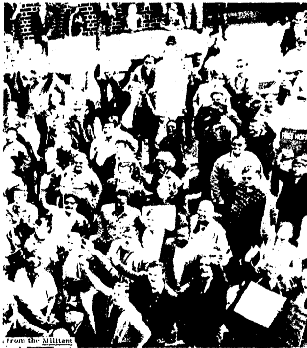
Cleveland Teamsters during April walkout

The nationwide Teamsters' strike-lockout-wildcat of spring and early summer this year had many lessons for labor. Militant, independent action of the ranks in major locals won some significant gains for the rank and file.