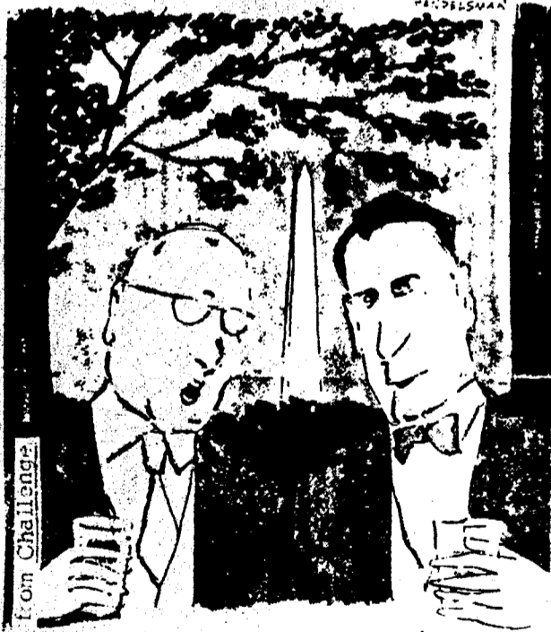
"If you're interested, Senator, we could begin grooming you as a lesser evil."

An example of such a transitional demand is the "sliding scale of wages and hours" demand. One of the most serious problems that all unions face, and everyone is aware of, is the problem of unemployment caused by automation and the shrinking job market, and the bad effects this has on those who are still working. A large pool of unemployed labor is just what the bosses need to drive down wages. It helps the bosses by getting us to fight among ourselves over the crumbs, as when white construction workers feel threatened by unemployed Blacks, whom the bosses have organized and set against them. Blacks shouldn't lend themselves to union-busting expeditions such as this, but the white brothers were wrong in the first place for forming a job trust and keeping Blacks out! Eventually the job-trusting unions will be destroyed because of their narrow-minded attitude. The