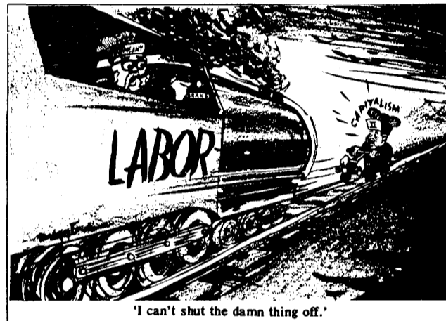
WL View: Workers Can Crush Capitalists, Keep Meany Too