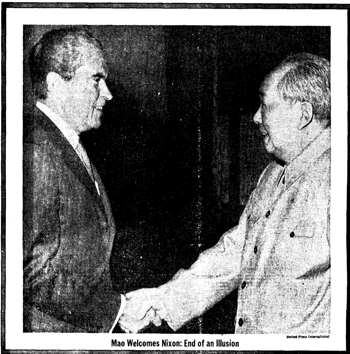
Mao Welcomes Nixon: End of an Illusion