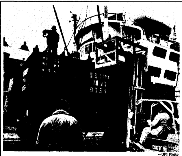
Military Cargo On Move During ILWU Strike

Those SSEU members still on the job today can testify how the merger has meant only a vast strengthening of the bureaucracy, producing a disastrous deterioration of working conditions. Contrary to WL lies, the Militant Caucus, which included Spartacist supporters, did not simply oppose the merger outright, but insisted on a struggle perspective as the basis for any merger. This meant especially a fight to defend the union's democratic structure and its gains wrung from the city administration during the SSEU's independent existence. On February 13, 1968, for example, the Militant Caucus submitted to the SSEU