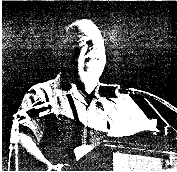
Juan Mari Bras, PSP secretary-general, addresses congress.

The PSP reaffirmed its traditional position of calling for a "patriotic front" of all Puerto Rican independence forces, including in this the bourgeois PIP. A resolution called for concrete