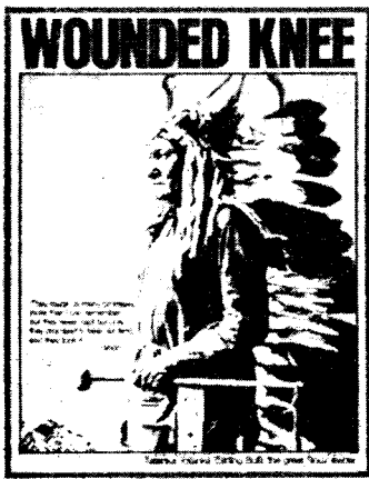
SWP/YSA hails "great Sioux leader," Sitting Bull.

capitalist politicians have more powerful interests to serve.