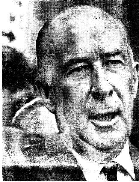
Mr. "Law and Order," former Attorney General John Mitchell, accused of approving illegal espionage against Democratic headquarters at Watergate.

"Ten months after the case first broke, it is still astonishing that senior officials in the confidence of the President