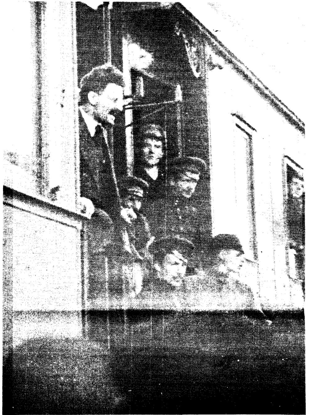
Leon Trotsky arriving in Petrograd, May 1917.

But socialism is the product of the liberation of the productive forces at the highest level of capitalist development: classes can be abolished only by eliminating want, that is, scarcity. Thus, while the dictatorship of the proletariat may be established in an isolated and backward country, socialism must be the joint achievement of at least