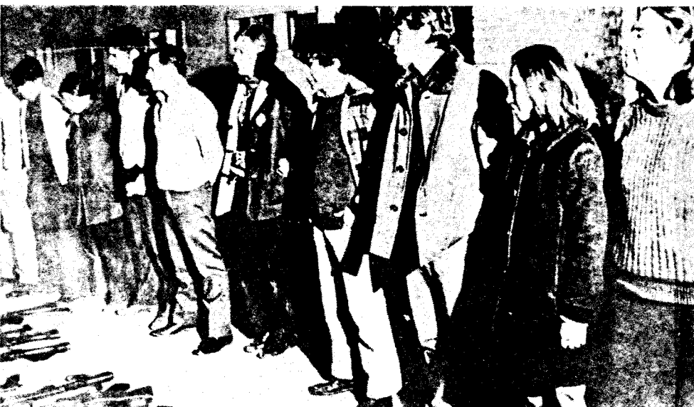
ERP guerillas at Trelew after attempted escape from prison in 1972. One week later guards shot them in cold blood, killing all but three.

Thus the PRT/ERP politically capitulates to the Stalinist policy of two-stage revolution and support for the "progressive bourgeois sectors." Guerillaism itself fundamentally disorients the advanced workers by point-