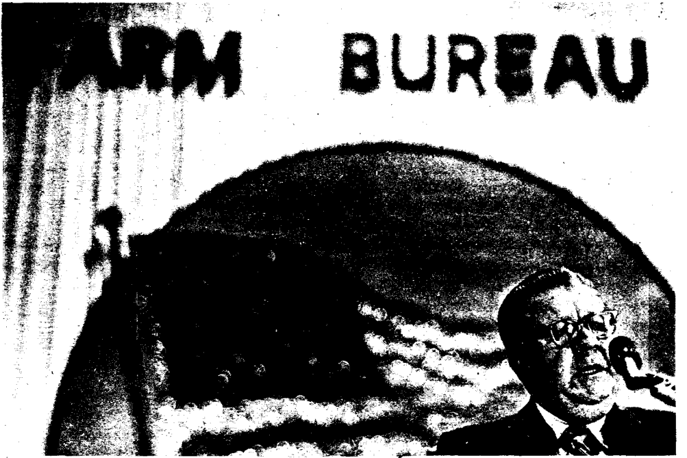
International Brotherhood of Teamsters President Frank Fitzsimmons speaking to the American Farm Bureau Federation this year. Recent newspaper accounts accuse the IBT of receiving money from growers to hire thugs to attack UFW supporters. A California paper reported Nazi party spokesmen saying the Nazis were paid by the Teamsters to send troopers to Coachella Valley to attack the Farm Workers union.

"It has been the United Farm Workers Union that has led great strikes and marches, that rallied millions in support of La Causa and La Huelga, and