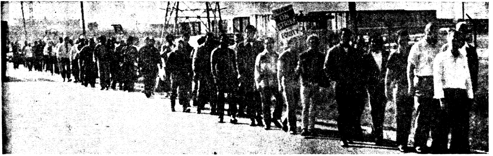
Mass picketing during recent strike at Ford's Chicago Heights Stamping Plant.