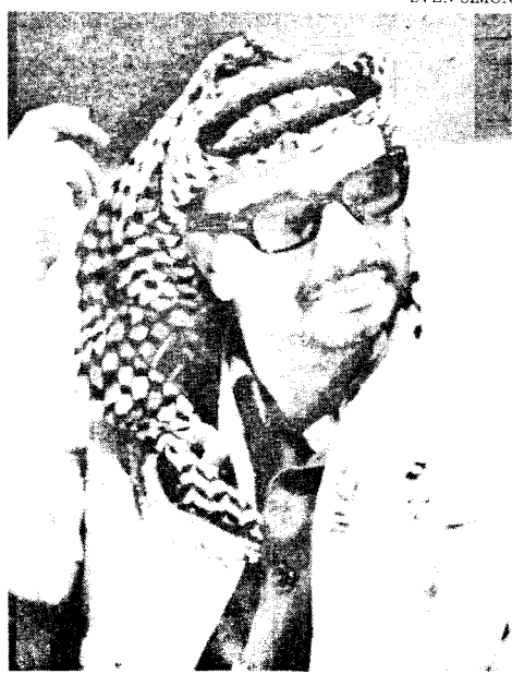
Yasir Arafat, head of Fatah. After the 1970 massacre of Palestinian resistance fighters by Jordan's King Hussein, Arafat signed Cairo Agreement shutting down Fatah guerrilla operations, preferring instead to hold onto his subsidies from Kuwait, Saudi Arabia and other reactionary Arab regimes.

Guerrillaism is no strategy for socialist revolution, as the Guevarists and Maoists would have us believe. The experience of the colonial revolutions