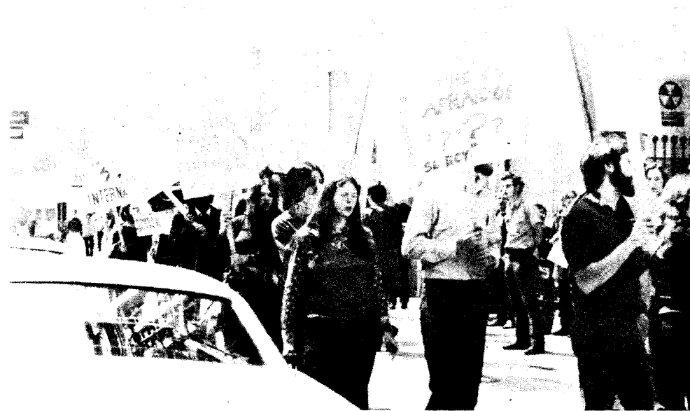
SL supporters picket WL exclusionism in Los Angeles, March 1973.

The 30 October Bulletin article concludes with a hardly veiled threat: "The actions of the Spartacist League are anti-communist in character and are open provocations. This is why the Spartacist League is barred from all our public meetings." The facts are just the opposite. It is the WL's anti-Leninist practice of excluding opponents from public meetings which denies the principle of workers democracy and is responsible for the SL's picketing. Such protest, including the tactic of picketing exclusionist meetings, is not anti-communist, but a defense of communist principles. ■