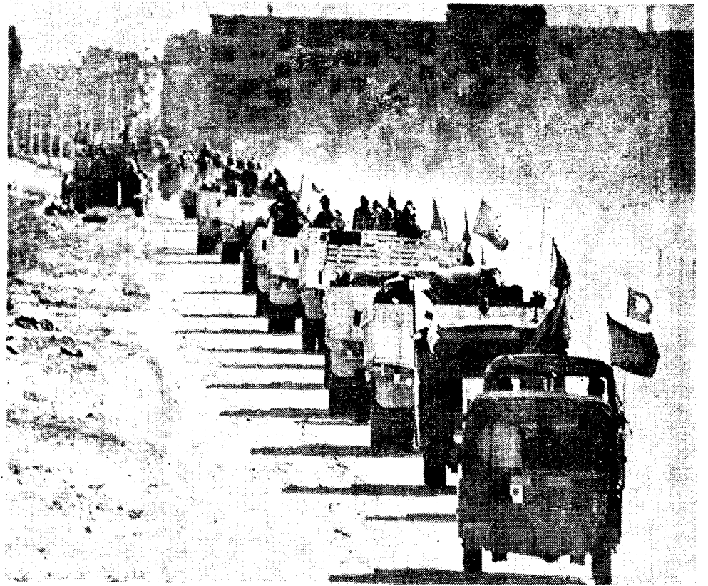
Trucks with UN ceasefire observers entering the city of Suez.

SL Polarizes Toronto Women's Conference . . . . 4