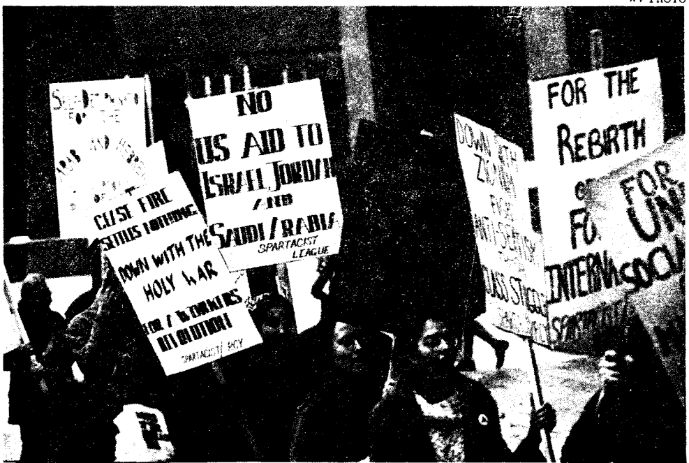
SL/RCY demonstrate in Boston against U.S. aid to Israel, Jordan and Saudi Arabia.

ing as a client state of the U.S., in reality, the alliance between the American ruling class and Zionism is complex and breakable.