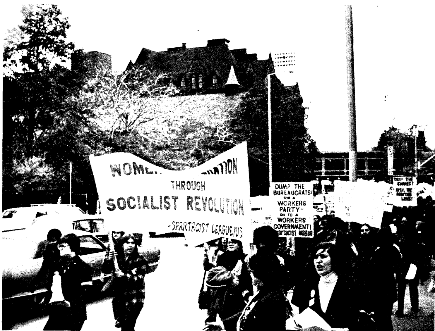
SL contingent marching in Toronto demonstration to defend Dr. Henry Morgentaler, charged with performing illegal abortions.

Saturday morning was devoted to a special session and rally for the defense of Dr. Henry Morgentaler, a Montreal physician who has been charged under Canada's Criminal Code on thirteen counts of performing and conspiring to perform illegal abortions. His trial, which has already begun, could result in a sentence of life imprisonment. The defense of Dr. Morgentaler has been the LSA's single-issue substitute for politics. Limiting its slogans to "Free Dr. Morgentaler, Drop the Charges!" the LSA has opposed even linking this campaign to demands for the repeal of abortion laws. (Not to mention calling for free abortion, a demand which the LSA and SWP consistently refuse to raise, even though it is supposedly part of their programs, on the grounds that it would make impossible their desired bloc with bour-