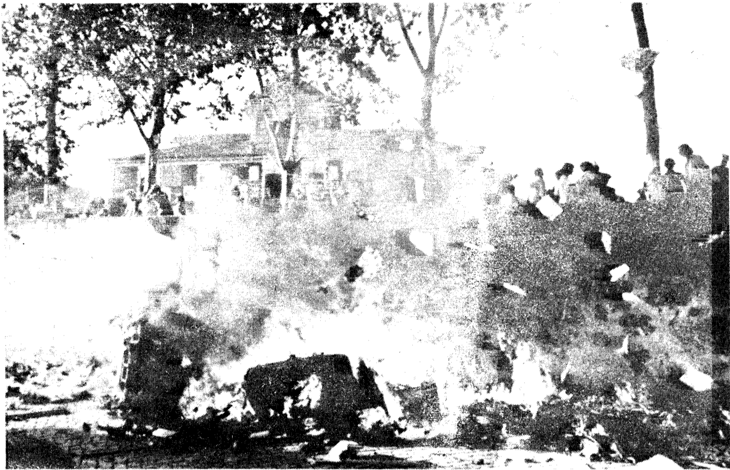
Rightist mob burns Communist Party documents after sacking CP headquarters at Vila Nova de Famalição. L'Express