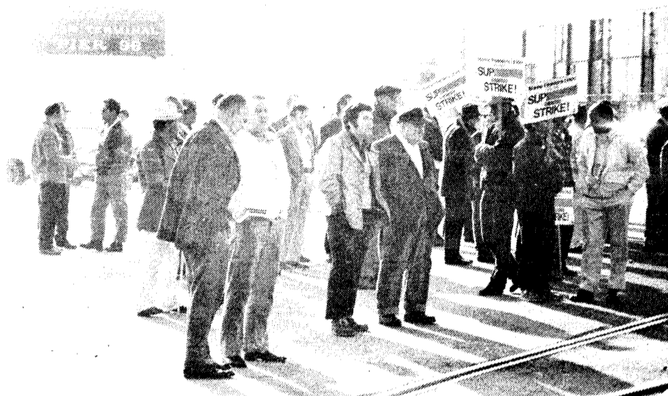
SUP strikers manning picket lines in July.

For seamen and longshoremen, faced with a scarcity of jobs and incessant infighting among the union bureaucrats, one thing is clear: only by ousting the present scab misleaders can genuine maritime labor unity be achieved and the tie broken with the capitalist shipowner politicians. Only by fighting for a full class-struggle program can the fratricidal traditions of pro-capitalist business unions be replaced by the struggle of all workers against the exploiters. ■