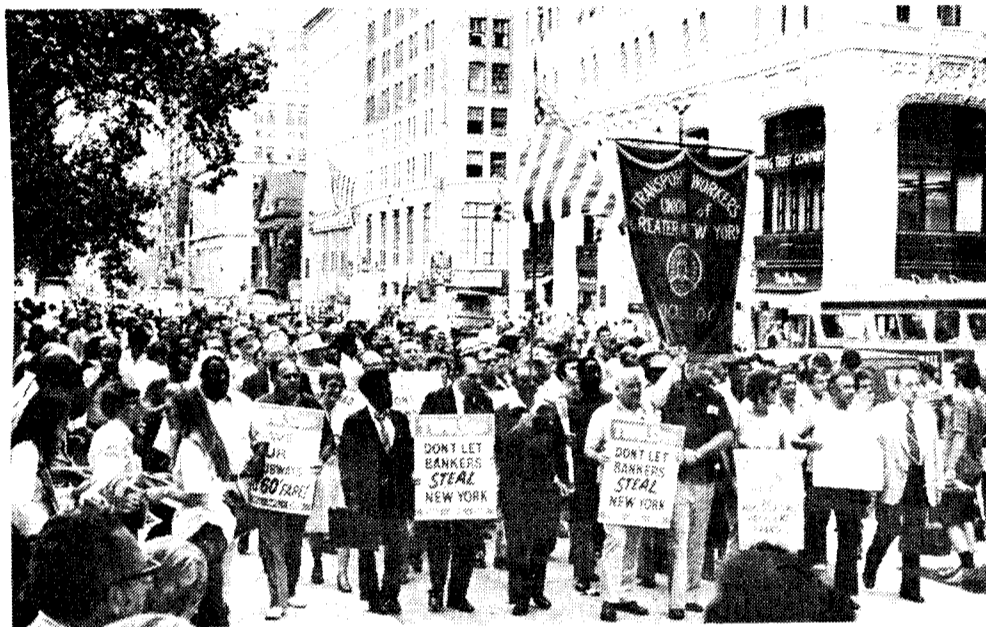
NYC Transit Workers demonstrate on July 29 against the fare hike.

Feeling pressure from his ranks, UFT president Albert Shanker (a right-wing Social Democrats USA leader and ardent Meany supporter) got himself thrown out of the city wage-cut negotiations late last month and took the occasion for some cheap shots at the lack of militancy of his rival Victor Gotbaum (member of the more "left" Democratic Socialists), presi-