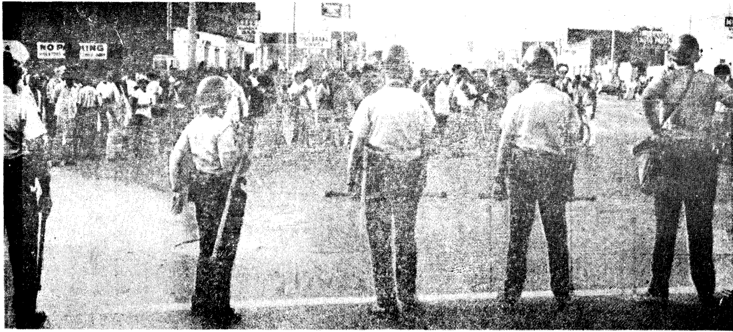
Detroit, July 29: cops move against black youths protesting killing of Obie Wynn.