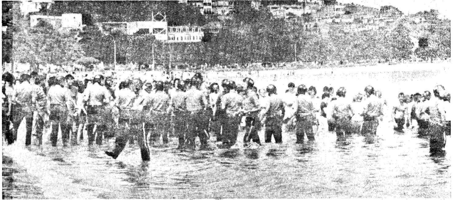
Boston cops form barricade between black and white demonstrators at Carson Beach.

In the tense weeks preceding school opening a grim scenario is unfolding. Phase Two opens new areas of the city to the busing program although one all-white neighborhood, East Boston, will remain segregated. The extension of busing into these areas, especially Charlestown (a social and ethnic mirror image of South Boston), will almost surely be met with violence by the racists, who have demonstrated the ability to mount large armed mobs on a few hours' notice. Black children may pay in blood for the crimes of reformist misleaders who preach reliance on cops and courts to secure and defend the democratic rights of black people. For their part, the Boston Police Patrolmen's Association has made its sympathies amply clear by its financial contributions to ROAR, the umbrella anti-busing organization. In the many attacks on black people, the police have either been conspicuously absent (as on the first day of school last September when a mob of white youth had a free hand in trashing school buses taking black children home from South Boston) or else criminally slow to act (as in October when a black Haitian worker was dragged from his car and nearly beaten to death, or in December when a lynch mob kept black students trapped in South Boston High School for several