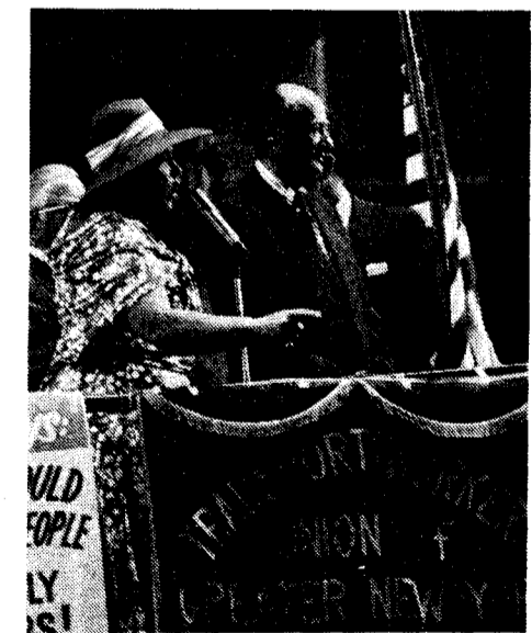
Congresswoman Bella Abzug addresses NYC Transit Workers rally.

The increasing nastiness and brutishness of city life combined with Big MAC's master plan for across-the-board cut-backs opens a possibility for the labor movement to pull in behind it the vast majority of the NYC populace. This in no