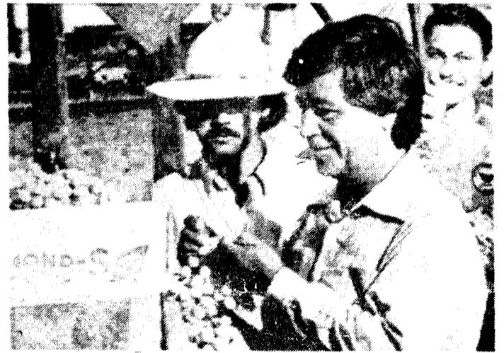
UFW leader Cesar Chavez talking to farmworkers in California this month.

Class-conscious workers must support the UFW against the strike-breaking Teamsters in the upcoming elections, but the traitorous Chavez leadership has ensured that this will be far from enough