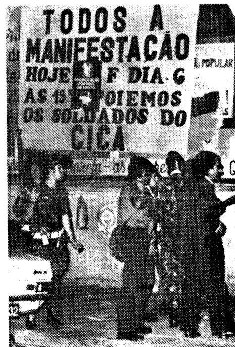
Porto poster backs rebel soldiers.