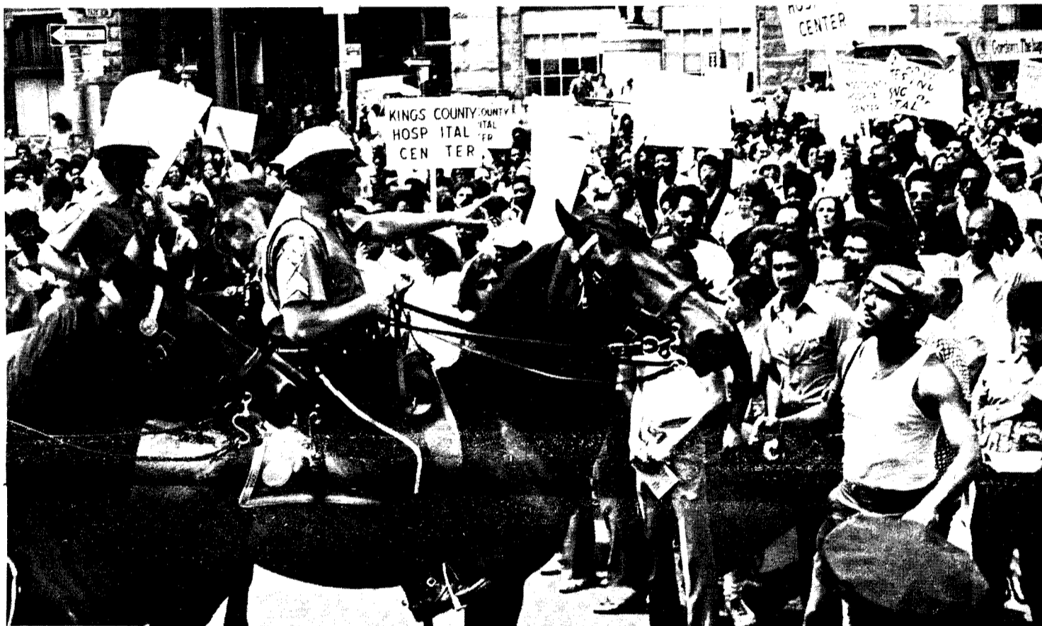
New York cops failed to prevent militant hospital workers from marching across Brooklyn Bridge in July.