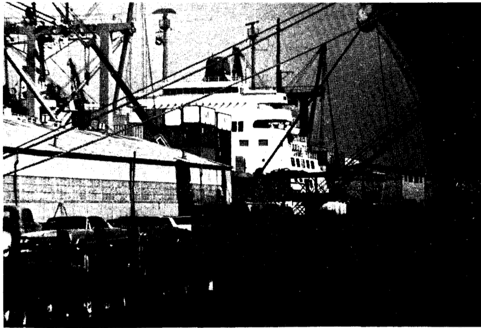
Ship docked in S.F. harbor.