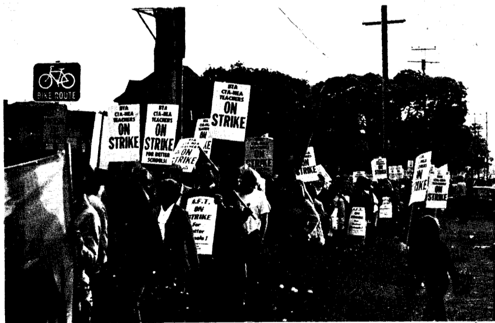
Berkeley teachers picket, September 9.

The school board was as intransigent during this strike as the City Council was during the firemen's strike. Not to be