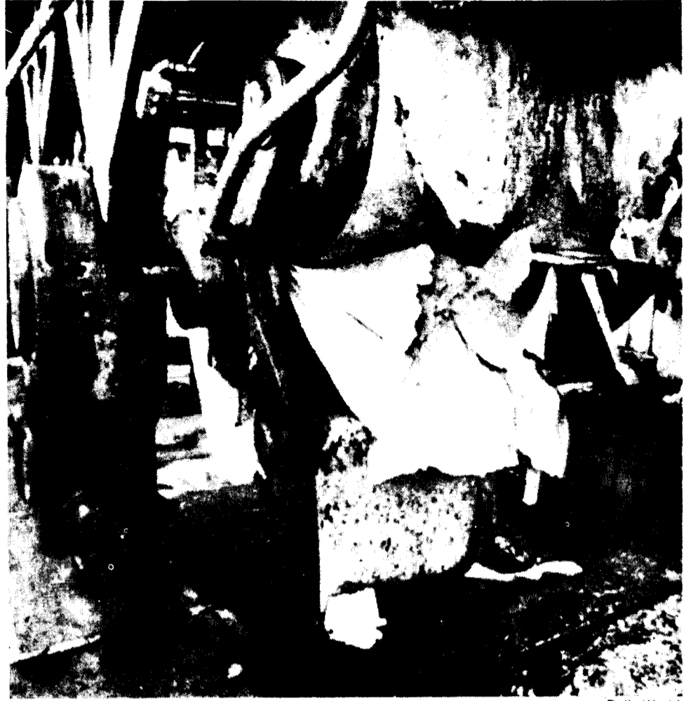
Damaged presses at the Washington Post.

The Post's incredible bargaining demands, which are designed to drive up