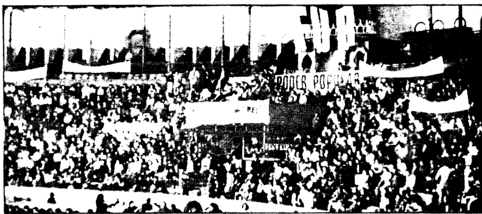
Demonstration by "Revolutionary United Front" in Lisbon.