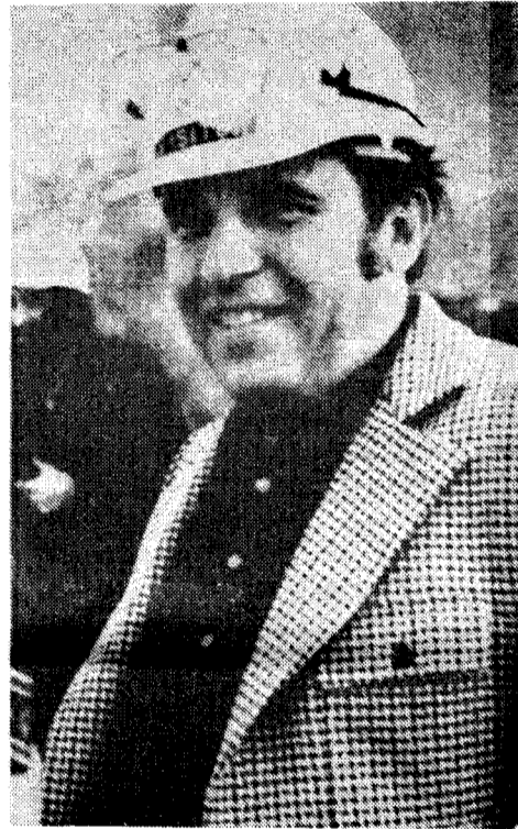
Dave Barrett Globe and Mail [Toronto]

A PDC spokesman read statements of solidarity received from the Spartacist League and the Spartacus Youth League, and from two trade-union caucuses, the Committee for a Militant UAW (Local 1364) in Fremont, California, and the Militant Solidarity Caucus of UAW Local 906 of Mahwah, New Jersey. He quoted from the Militant Solidarity Caucus statement: "Once again an innocent victim is railroaded to prison while the real criminals, the giant corporations who daily exploit millions of working people, the mass murderers of Vietnamese peasants, the Nixons and the Rockefeller-fellers, go scot-free. This is the meaning of 'justice' in the context of capitalist law and order." ■