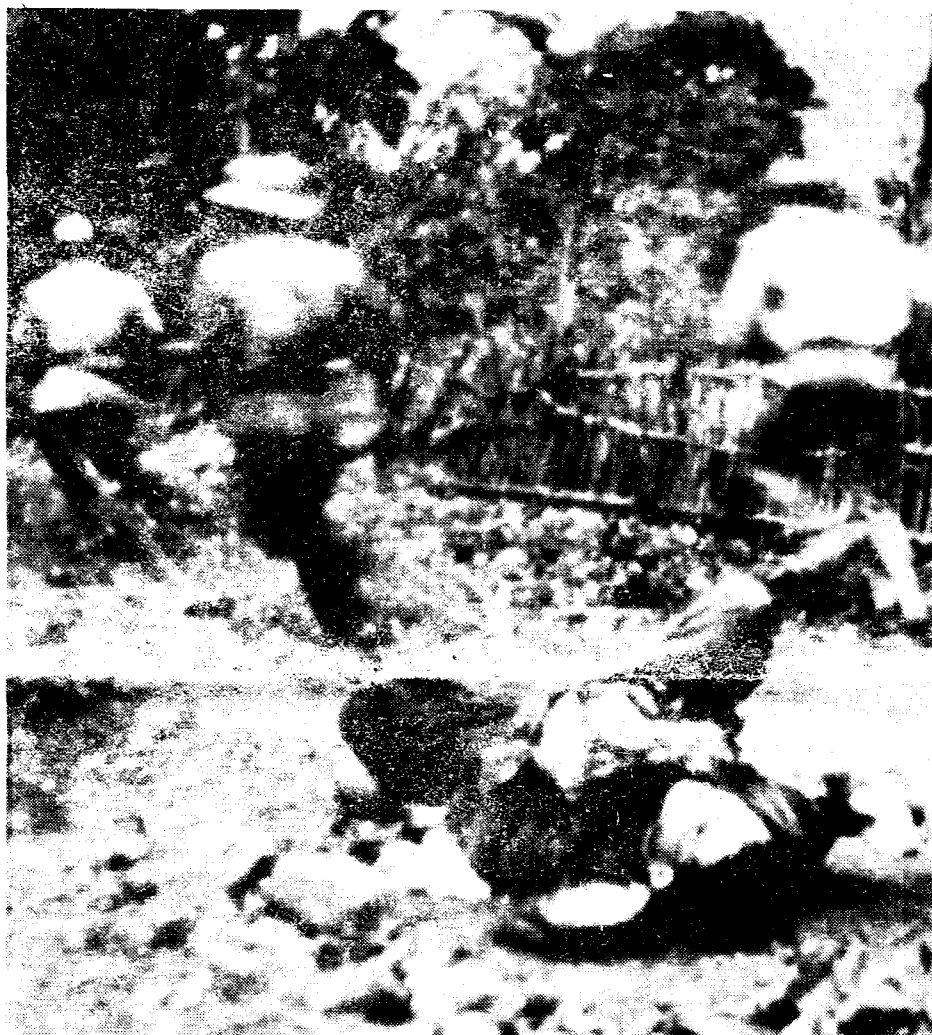
Vietnam News Agency

"Will the Soviet Union enter the fray and seek to put China 'in its place'?" "Despite the relative optimism shown in Washington and most Western capitals, the question is far from theoretical. It is even the essential question, because the