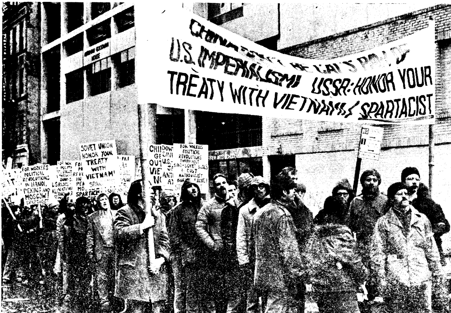
Spartacist contingent at the Chinese Mission in NYC, February 24: Only the Trotskyists will truly defend the Soviet Union against imperialism.

Significantly the Vietnamese UN mission telephoned greetings to the February 20 SL protest. Equally interesting, reporters and cameramen from the Soviet press and television showed up to cover the demonstration. Izvestia interviewed a Vietnam veteran as Moscow TV extensively filmed the protest. However, while they were eager to show that opposition to the Chinese invasion extended beyond the isolated CP, the reporters carefully turned off