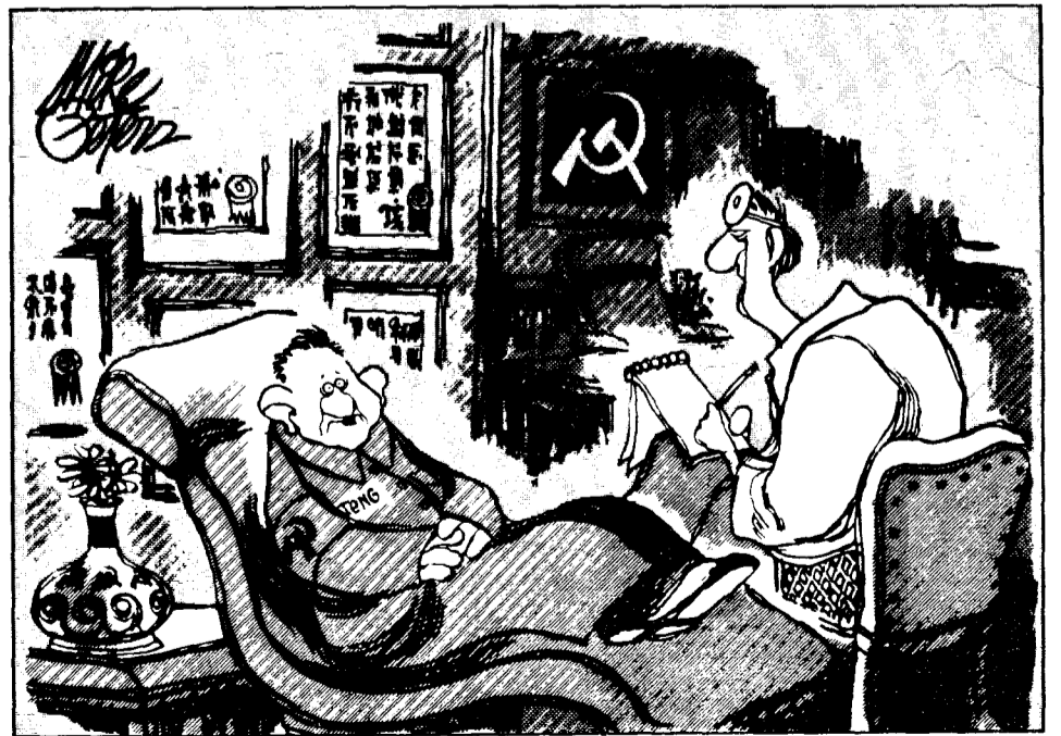
Mike Peters

— Spartacist No. 5, November-December 1965