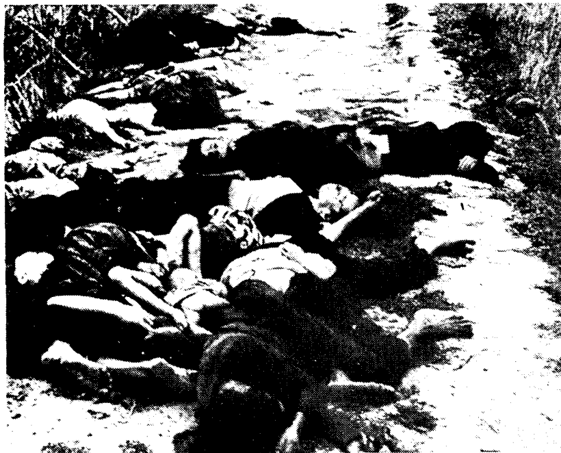
It will not go away: My Lai.

Things certainly look different today than they did a decade ago when ringing chants of "Ho, Ho, Ho Chi Minh"