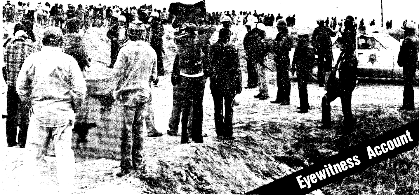
Cops stand by impotently as Farmworkers pull out the scabs.