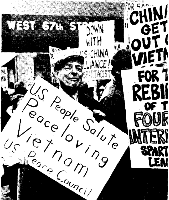
CP fronts appeal to liberal pacifism, Spartacists demand of the Soviet Union: "Honor Your Treaty with Vietnam."

Through its various front groups, the CP sought to give the demonstration a sappy liberal coloration. One of its slogans was "Brzezinski/Teng—Enemies of World Peace." By singling out the successor to Kissinger in this fashion, the Stalinists put forward their