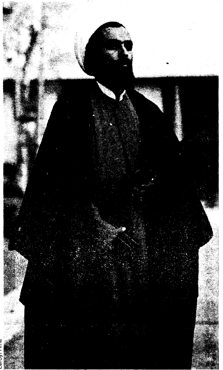
Gun-toting mullah of the Islamic police: Khomeini's new SAVAK.

"And what of the Maoist and guerrillaist groups which vehemently denounce Tudeh's reformism? They too speak only of the 'progressive religious leaders,' echoed by their supporters in the