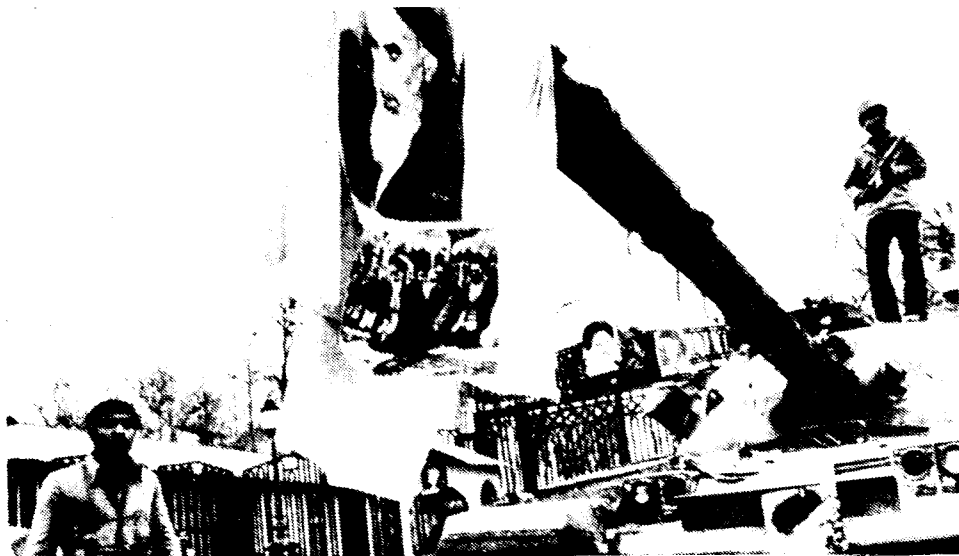
Mullah-led forces take over tanks guarding the shah's palace.

The surrendering was not just voluntary. Spotchecks of automobiles