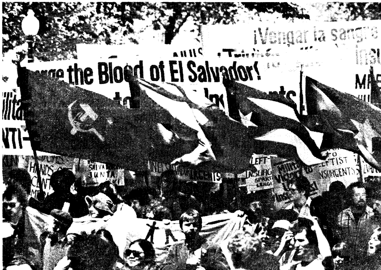
Anti-Imperialist Contingent, May 3.