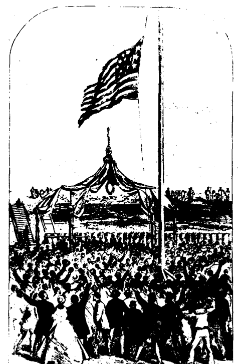
National Park Service

There can be no economic equality nor justice for black people in this capitalist society. As Frederick Douglass said, "Experience demonstrates that there may be a slavery of wages only a little less galling and crushing in its