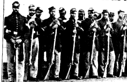
Two hundred thousand black recruits turned the tide for the Union Army in the Civil War.