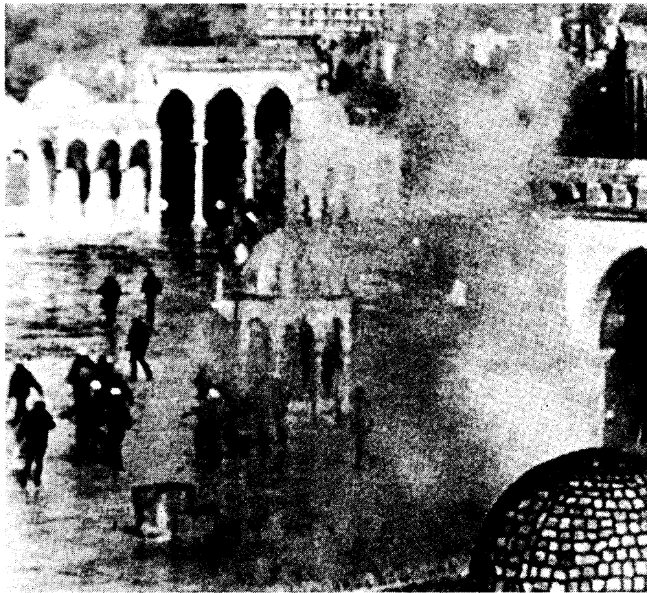
Clouds of tear gas pour over Al Aksa mosque in Old City of Jerusalem as Israeli police beat Arabs, desecrate Muslim shrine.

On January 19, Rabin announced a "new" policy of "force, might, beatings." For years the border police have routinely broken into homes to beat Palestinians; the Shin Bet secret police routinely hang people by their hands