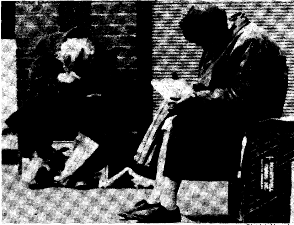
Homeless take shelter in New York's Penn Station.