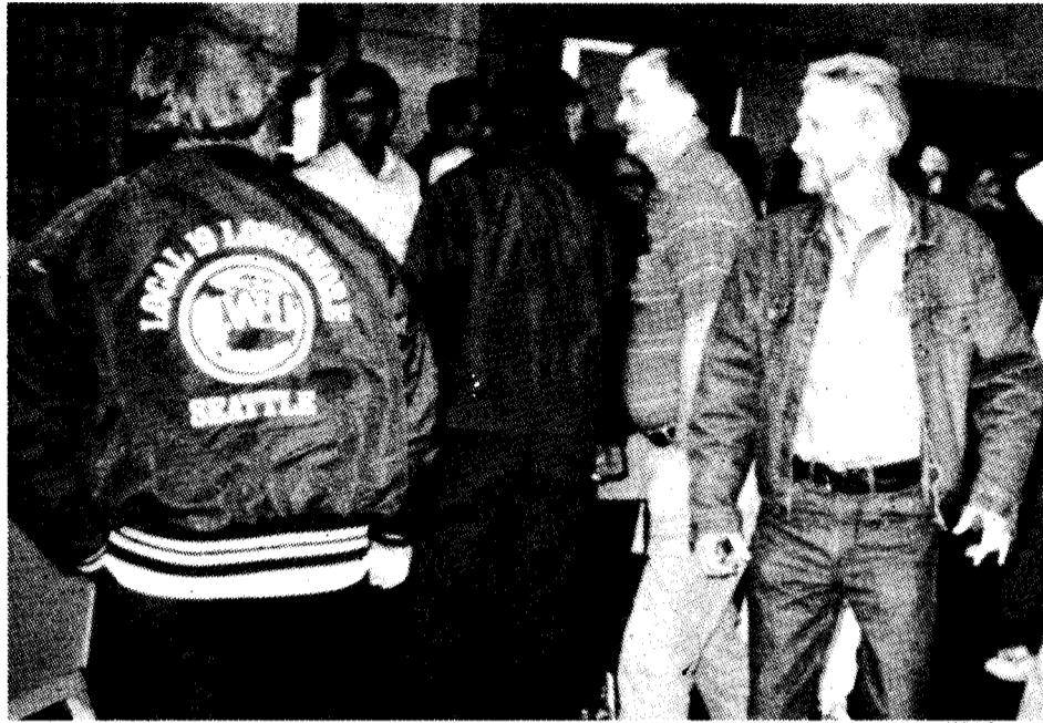
Militant longshoremen stream into strike meeting at Tacoma Dome, January 14.

But the 3,800 longshoremen who gathered at the Tacoma Dome were in no mood for more concessions. Arriving in a blinding rainstorm, longshoremen snapped up copies of the Workers Vanguard supplement "Labor's Gotta Play Hardball to Win"; over 450 WV s and supplements were sold and distributed as workers streamed into the Dome. They knew they had the power to