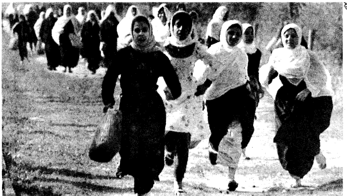
Palestinian women, under Israeli starvation siege of Gaza camps, dash to buy food.