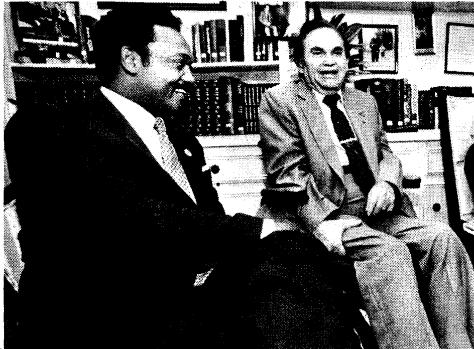
Jesse Jackson woos racist Dixiecrat George Wallace in bid for Democratic Party nomination.

after a civil rights delegation from Mississippi was booted out of the Democratic National Convention and a racist Jim Crow delegation was seated in its place. Carmichael helped found the Lowndes County Black Panther Party in Alabama and was the man most associated with the slogan "Black Power!"—