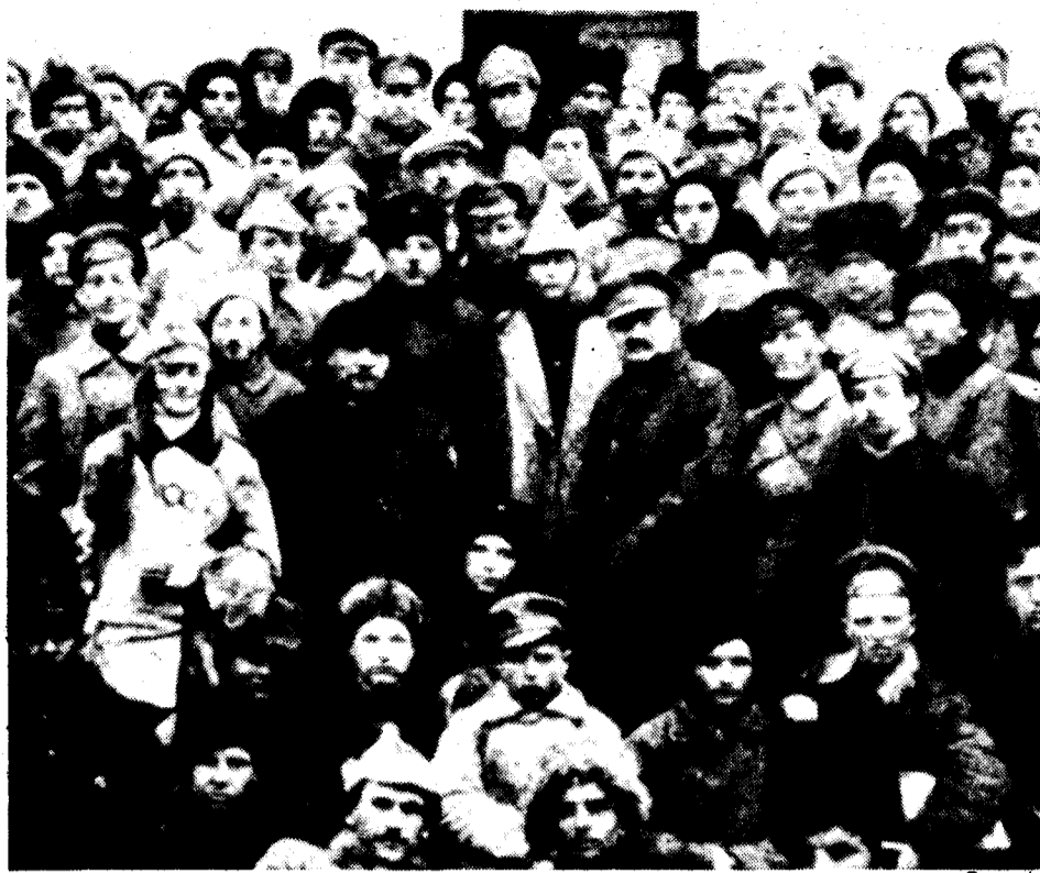
Bolshevik leaders Lenin and Trotsky stand among soldiers sent to suppress Kronstadt mutiny in March 1921. War-weariness and economic exhaustion fueled forces of counterrevolution.

"Communist rule has reduced all of Russia to unprecedented poverty, hunger, cold, and other privations. The factories and mills are closed, the railways on the verge of breakdown. The countryside has been fleeced to the bone.... The peasants and townfolk have lost all hope for an improvement of their