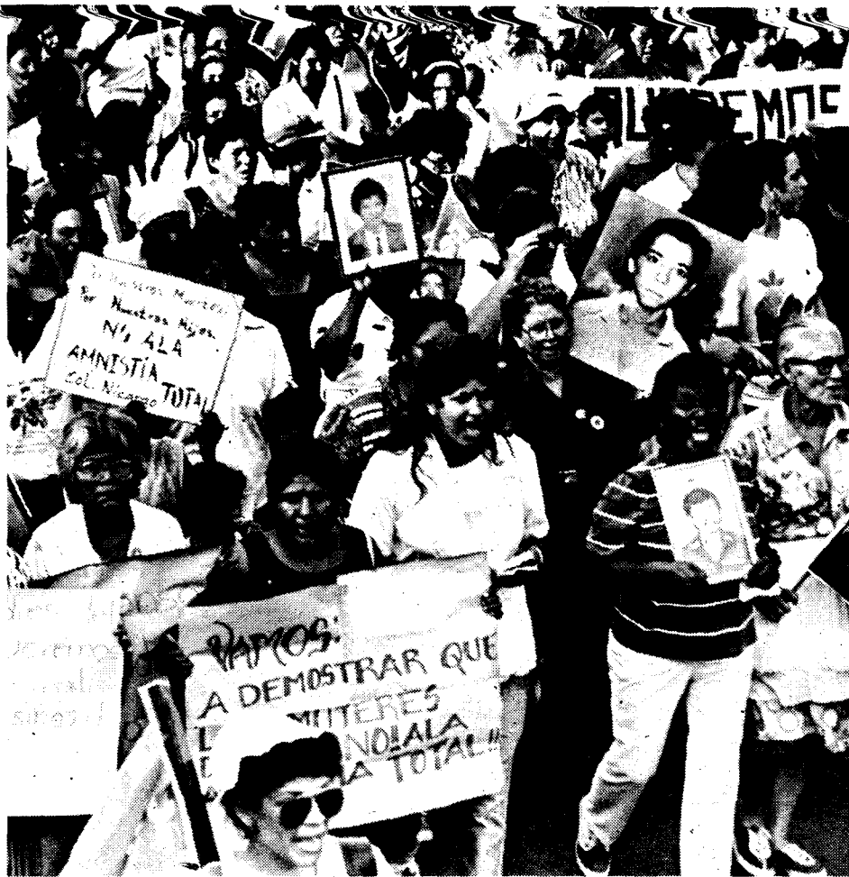
Nicaraguan women march in Managua last fall against amnesty for imprisoned National Guardsmen and contras. Many carry pictures of their children killed by Somoza's butchers and Reagan's terrorists.

So the war goes on and on, and now that "the drums of peace" are beating, the warmasters in Washington have sharply escalated the killing. But now,