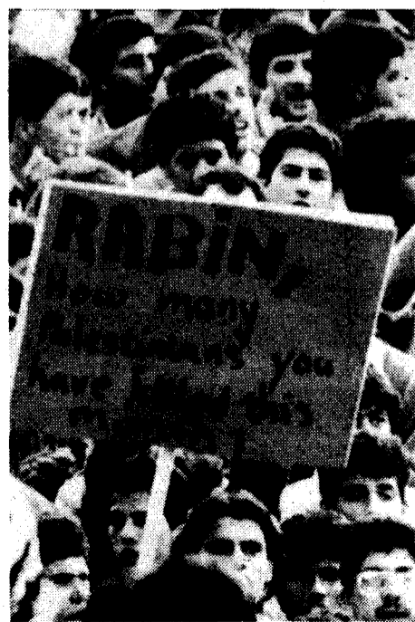
Israeli Arabs protest in Nazareth against Zionist reign of terror in occupied Gaza and West Bank.

And that requires above all the construction of a proletarian internationalist vanguard party that fights for the right to self-determination for both the Palestinian and Hebrew nations through a socialist federation of the Near East. ■