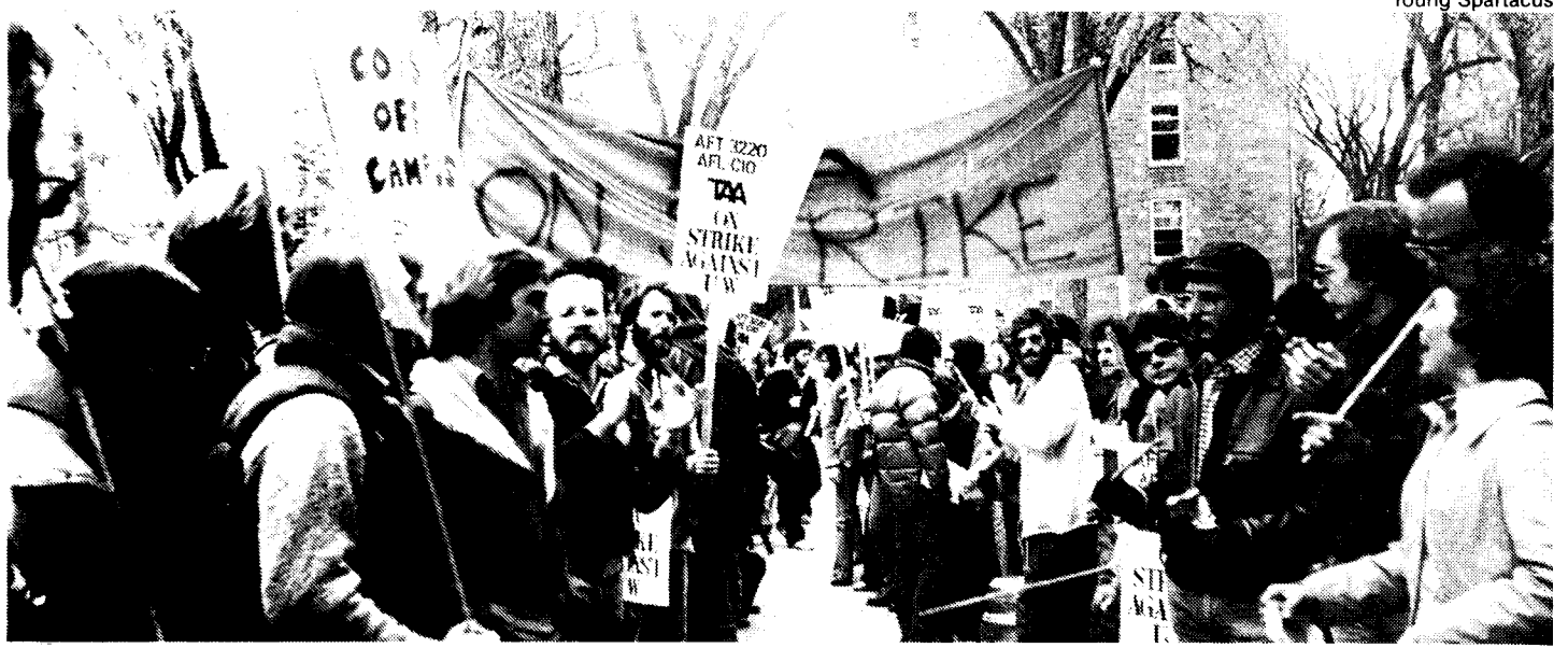
Rally in support of striking Madison TAs.

In the face of this drive by the administration to break the first teaching assistants union in the country, it was crucial that campus workers in the Memorial Union Labor Organization (MULO) and the American Federation of State, County and Municipal Employees (AFSCME) go out in solidarity with the TAA and shut the campus down! But the TAA leadership avoided this call for a campus-wide strike. MULO never went on strike even to enforce its own demands, and on May 1 the MULO leadership stabbed the TAs in the back by signing an agreement with the administration. While the United Faculty (a union of over 200 professors) supported the strike by honoring TAA picket lines, the faculty senate voted to commend administration strikebreaker Shain. What is needed to fight the university bosses' "divide and conquer" schemes is the fight for common contract expiration dates, a drive to