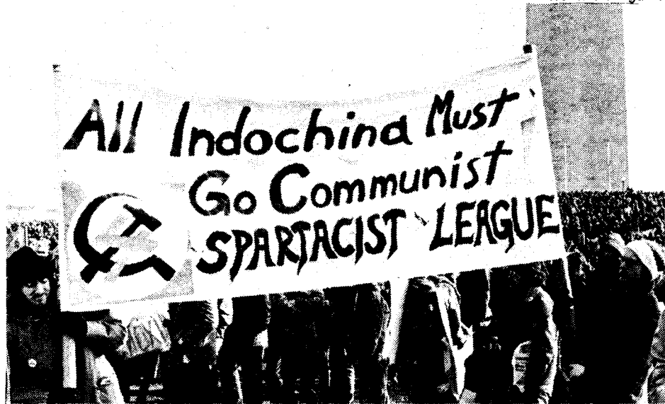
Spartacists cut through liberal pacifism, 1973 (above)...1980 (right).

Democratic Party was the SWP with their line that there weren't class questions posed in Vietnam: it was not the workers and peasants vs. the landlords and U.S. imperialism, it was simply a question of should American boys be killed. So under a socialist guise, it's the Tom Hayden line of today and it was the line of the various "doves" of those days: American boys shouldn't be killed; let's bring the troops home now. And the question that the New Left was groping toward was that imperialism isn't a policy. Imperialism is, as Lenin