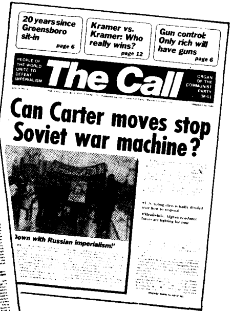
Who opposes the draft?

public education and social services and tells black youth that the solution for unemployment is driving taxis! The latest CCARD leaflet, written by the Libertarians and approved for distribution by CCARD as a whole, actually quotes Jimmy Carter (!) on the adequacy of the volunteer army and says that the problem with the draft is that it would "allow the Armed Forces to return to the inefficient practice of using highly-skilled draftees for menial labor such as KP, instead of paying civilians [i.e., blacks] to do this work."