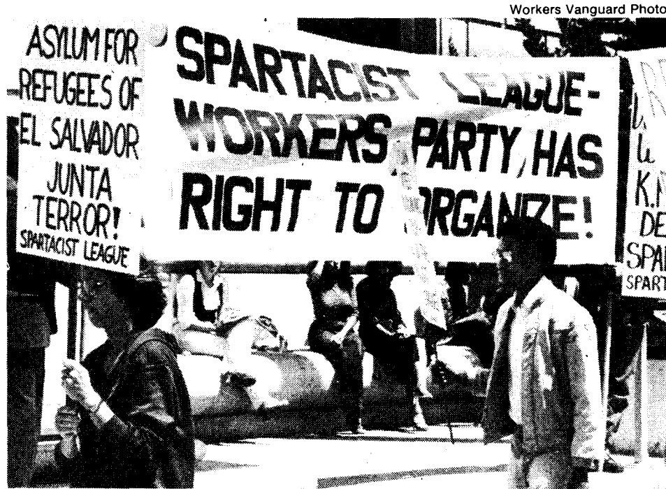
July 23, 1981: SL/SYL protest Deukmejian report in San Francisco.

bloody toll of the anti-Panther COINTELPRO operations: