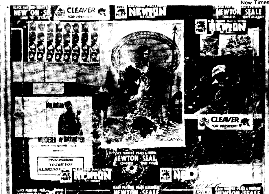
1968: Oakland Black Panther headquarters riddled by cops' bullets. This is how the state deals with those it labels "terrorists."