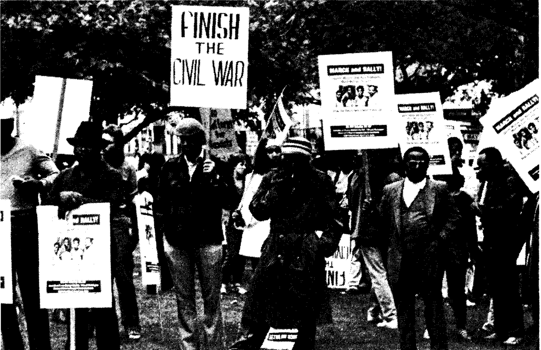
nd, October 29: Labor/black rally protests klan terror, cop murder, racist frame-ups—we o finish the Civil War!