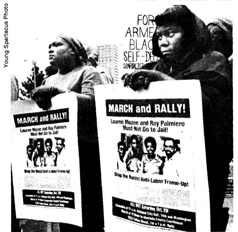
Young Spartacus Photo

The fight is far from over. Workers, blacks, students and youth all have a stake in the victory of this crucial defense effort. Keeping these class-struggle fighters out of jail and winning their jobs back will take a lot more