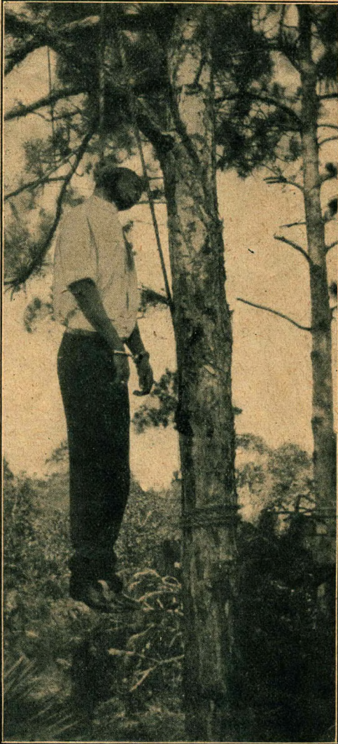
A Negro worker lynched in Florida, U. S. A.

That is why the present wave of lynchings rage in the U. S. A. That is why over 40 Negro workers were lynched last year in the U. S. A. and over 15 already this Year. That is why only a few weeks ago in the State of Texas two white organizers of the Red Trade Unions, for organizing black and white workers, were kidnapped, beaten, thrown into a river and left to die by the fascist Ku Klux Klan of the ruling class.