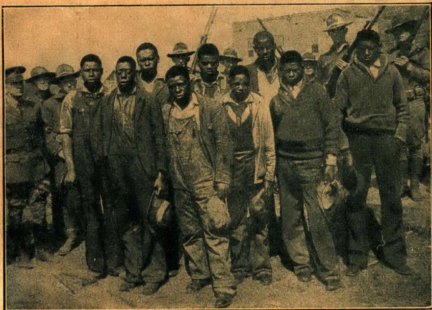
THE 9 NEGRO BOYS, ranging in age from 14 to 19 years, in the hands of the State soldiers

Despite the stirring up of racial prejudices by the ruling class, confusing the minds of poor white farmers and workers and thus misdirecting their fight against unemployment and starvation from them (the ruling class) into lynching bees