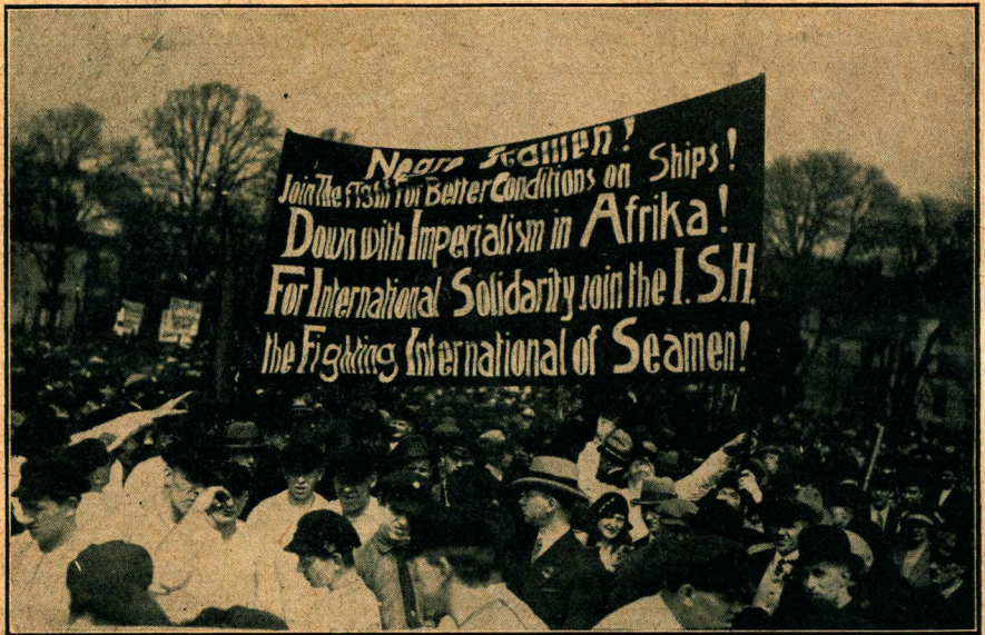
INTERNATIONAL SOLIDARITY — On May 1st at Hamburg, Germany, 100,000 revolutionary workers carried the above banner in their demonstration

The workers of South Africa are beginning to realize that for years they have been deceived by the rulers and that every one of these rulers who wants to satisfy his political ambition does so on the backs of the workers. But the revolutionary leaders are exposing these treacherous Social Fascists. The African workers are rising from their long sleep and will fight their enemies. Long live International solidarity of the Workers of the world. Defend the Soviet Union the First Workers State. Down with British Imperialism.