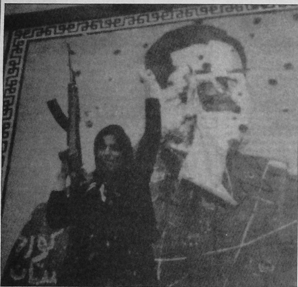
Spot the real anti-imperialist

Trotsky, writing on the question of the Sino-Japanese war in a letter to Diego Rivera, printed in Leon Trotsky on China (quoted by the Workers Press , February 28 1991, in an article entitled "Why Trotsky supported China's war" - in defence of its support for Iraq in the Gulf war), advanced the tactic of support for China, under the bitter anti-communist leadership of Chiang Kai-shek, in