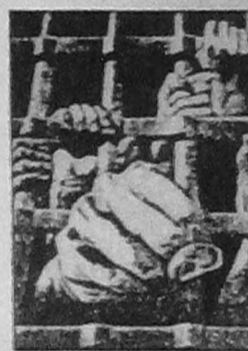
Bobby Sands' Trilogy : power from the prisons