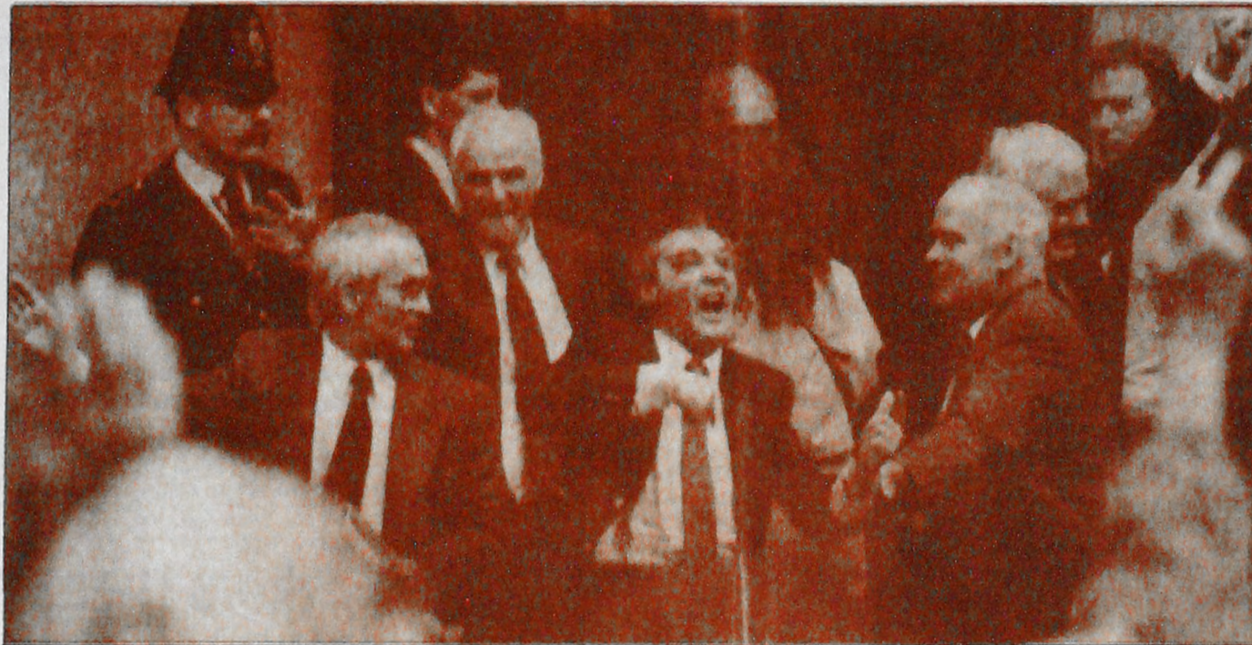
Six free at last; but there's hundreds more where they came from

working class people fighting against their imprisonment, but from above, with an alliance of establishment politicians, cardinals and media personalities. The masses have remained passive and uninterested, and the illusion is retained that it is 'great men' who make history.