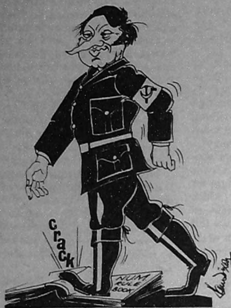
Is Arthur a 'Stalinist' monster... a revolutionary saint...

National Executive Committee of the NUM, Preliminary Agenda of the Special Rules Revision Conference 1985, 1985, pp.34.