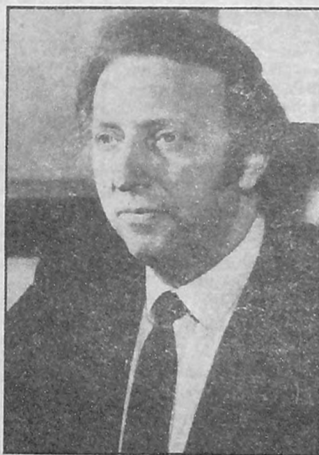
...or a left reformist

The offering from the Revolutionary Communist Group, culled largely from its weekly Fight Racism! Fight Imperialism! , falls into the same trap over the women of the coalfields. Miners' Strike , too, vaunts the ladies of Greenham: "The courage and determination of the Greenham Common women is regarded by these women as an inspiration." (p.29). The RCG is not now, of course, a Trotskyist group. But the petty bourgeois nature of its revolutionism leads it into areas of agreement with the Socialist Organiser Alliance. For example, Miners'