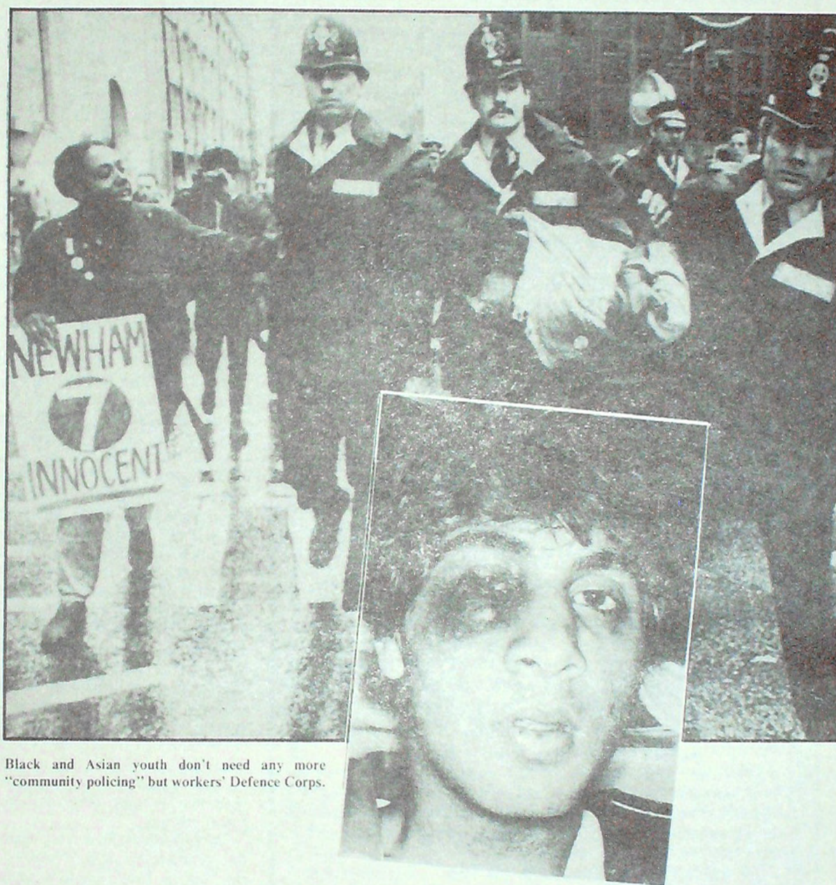
Black and Asian youth don't need any more "community policing" but workers' Defence Corps.

The underlying problem with 'self-defence' campaigns such as the Newham 7 one is not their militancy, but the lack of support and involvement from the broad mass of the working class. An attack on any section of the oppressed is a precursor for a more widespread and general attack on working people. The question is not only one for the black community but for the entire working class. By participating in anti-racist struggles, racist and