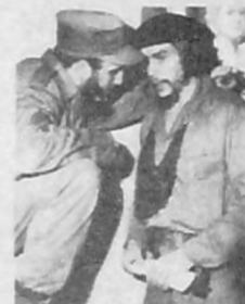
• Fidel says Che wouldn't have supported 'glasnost'

Those who have hopped onto the glasnost bandwagon might like to ponder on this snippet from the Evening Standard of October 12: "In a speech commemorating the 20th anniversary of Guevara's death, Fidel Castro attacked 'glasnost' as decadent materialism, saying it will never be adopted in Cuba while he is alive." Apparently comrade Castro sent a somewhat ruffled Shevardnadze back to Moscow. Given comrade Gorbachev's offer to Yankee imperialism on what he terms 'international hot spots' (central America?) and his market-orientated reforms (how profitable can the much subsidised socialist Cuba be?) one can see his point. Viva Cuba! Cuba Si!