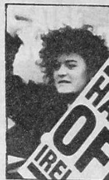
Hands Off Ireland! fights for mass working class based solidarity with Ireland's struggle for self determination

About 200 people attended the Terence MacSwiney demonstration on October 28 in South London's Brixton. The march was led by the Pollock republican flute band from Glasgow, and was supported by a number of left wing and Irish groups. Before the march set off, as well as at the rally at its end, the Workers Theatre Movement gave a spirited performance of Twenty years which was warmly received (there was one heckler who we originally thought was a fascist — however he turned out to be a member of Red Action). The largest contingent on the march was provided by Hands Off Ireland!, whose militant slogans dominated the whole demonstration. Our contingent was joined by passers by as the march progressed and many new contacts for HOI! were made. As a result, a HOI! meeting the following week in Brixton with the video Behind the Mask attracted a very good audience. The march could have been much bigger. A number of left wing groups showed their usual sectarianism and refused to mobilise for it. The SWP managed to mobilise only two persons, one for each end of a banner. The IFM/RCP withdrew its promise of support because it was (wrongly) not allowed to have a speaker. Although also denied speaking rights, HOI! distributed thousands of leaflets to publicise the march and is now stepping up its activity in the run up to the Bloody Sunday demonstration on Saturday January 27 (where no doubt the organisers will also refuse us the right to speak). TC