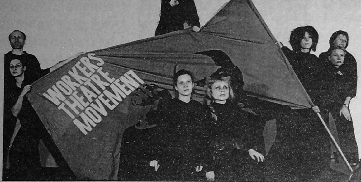
Agit-prop for the vanguard party