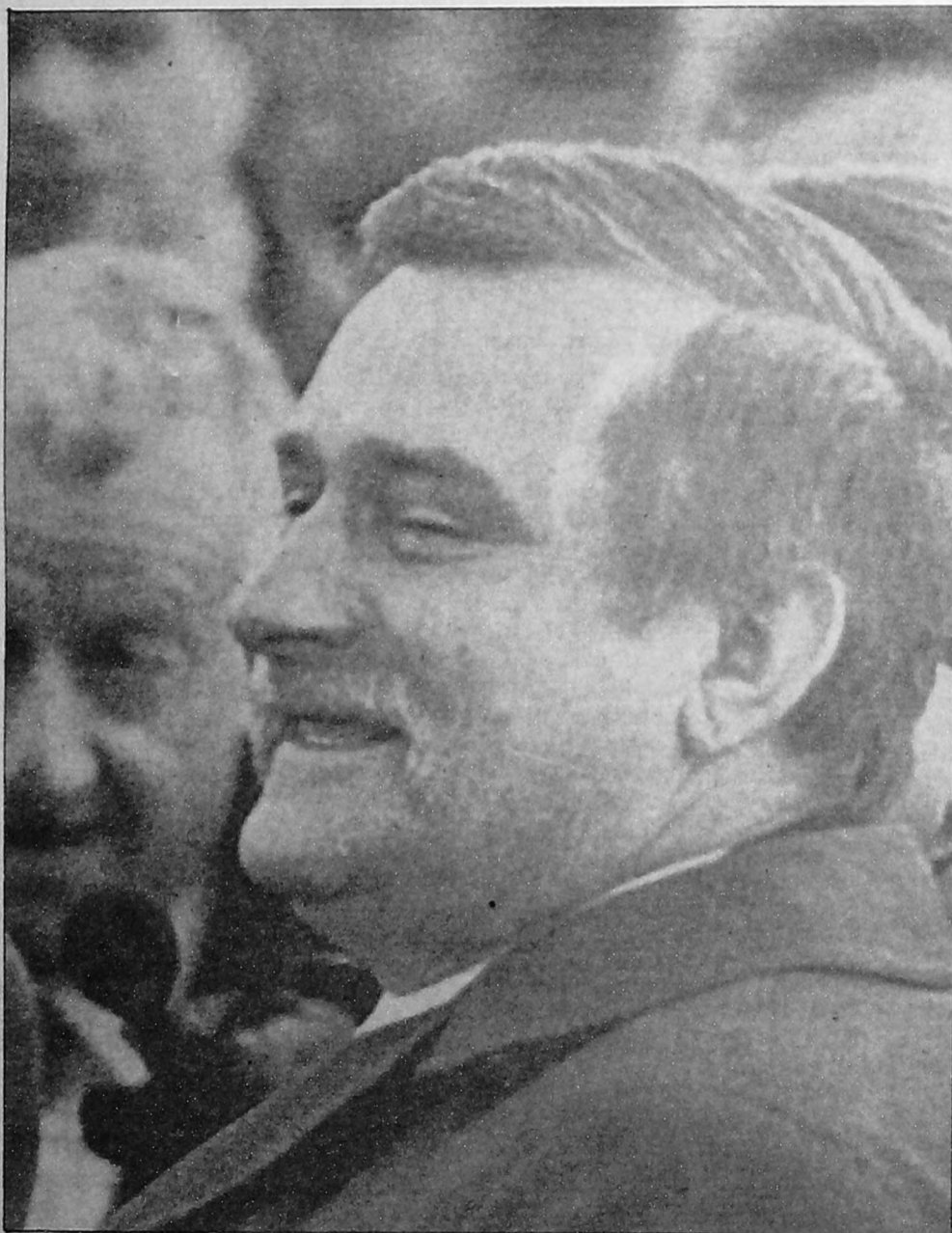
Political, or counterrevolutionaries?

The counterrevolutions in Eastern Europe have not only shown the bankruptcy of the 'official communist' leaderships in these states, but of those on the left in Britain who, for one reason or another, welcomed the collapse of bureaucratic socialism