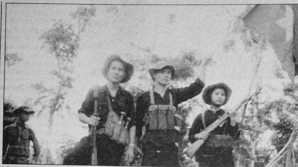
Vietnam showed that only working class leadership has any interest in socialism

The disintegration of socialism in the Soviet Union has not only precipitated the collapse of socialism throughout Eastern Europe; it has also thrown into crisis revolutionary regimes throughout the world. There is no better time to examine and reconsider the theory of socialist orientation