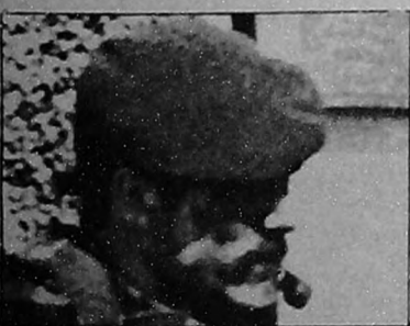
Beam them up, Scotty

INCREDIBLY, the new Star Trek sci-fi series (not a patch on the original, in the view of this writer) has fallen foul of the media ban on pro-Republican statements.