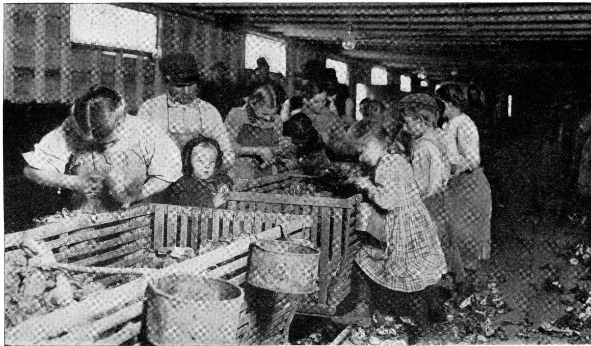
OYSTER SHUCKERS, 8 AND 10 YEARS OLD, WORK 10 HOURS A DAY.