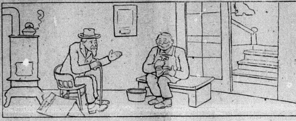
Dubious Dubb--Socialism is certainly on the down grade. Look how we got beat in Germany. Them fellows over there must be giving up.