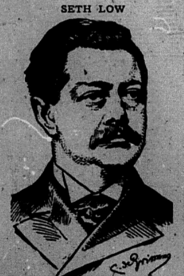
Former mayor of New York city, owner of large southern cotton mills and delegate to the Civic Federation convention in Chicago...