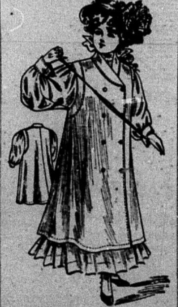
MISSSES SEVEN-EIGHTHS LENGTH COAT Paris Pattern No. 2114.

All patterns allowed. This serviceable coat for the coming Winter is developed in dark green shadow plaid broadcloth. The shawl collar, trimming straps, and the narrow cuffs of the full sleeves are of the material, cut on the bias. It is very simply tailored, having a single row of stitching along the edges, and a waist deep the front in double-breasted effect with black horse buttons. The model is also suitable for lady's dress, sailor suit, or any of the women's gowns in vogue at the present time.