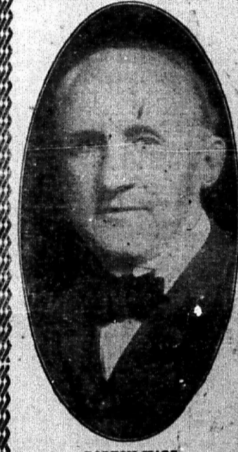
BOLTON HALL, New York