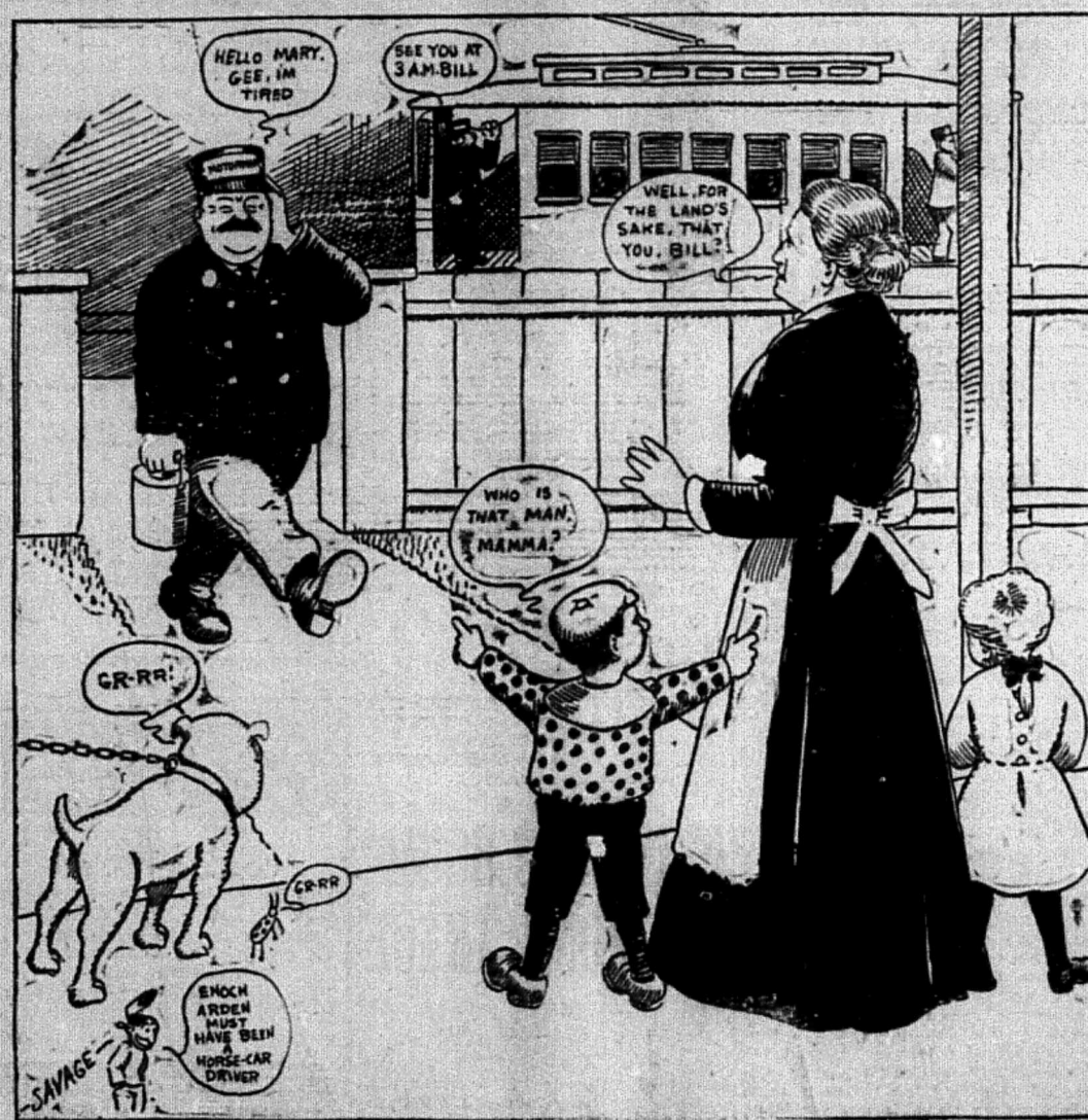
THE LOVED ONES AT HOME NEARLY FORGET HOW HE LOOKS