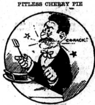
PITILESS CHERRY PIE

Providing the weather is fair, Minnesota and Chicago will clash on Marshall field this afternoon in the first battle this year between the two teams.