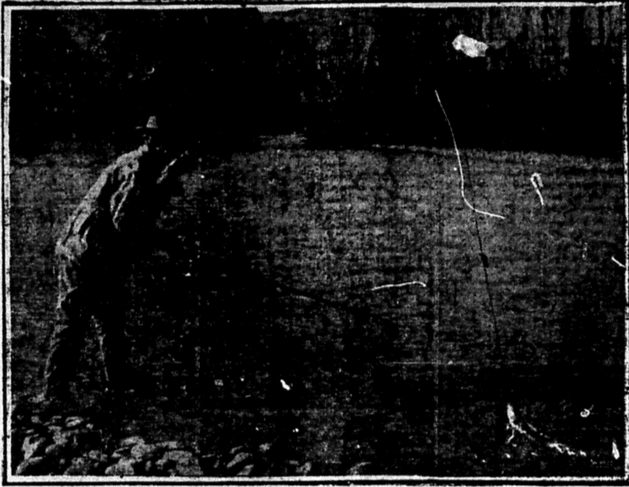
MOUNTAIN TROUT FISHING ON THE GUNNISON RIVER GOOD ENOUGH FOR ANYONE

Denver, Col., May 23.—Everywhere the disciple of Ike Walton is polishing the fly rod, overhauling his tackle, oiling the reel and patching his waders.