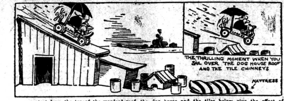
You start from the top of the wooded roof, the dog house and the tiles below give the effect of housetops below you.