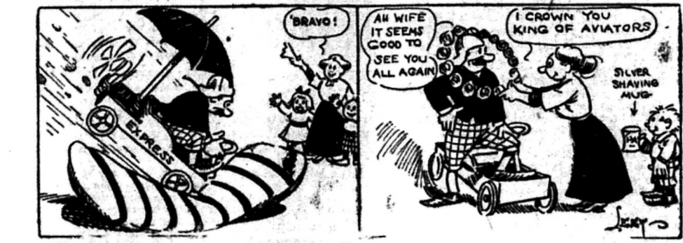
You fly off into space and land without injury on the mattress, having had all the sensations of an astronaut without the dangers, wife and the children adding realism by cheering.