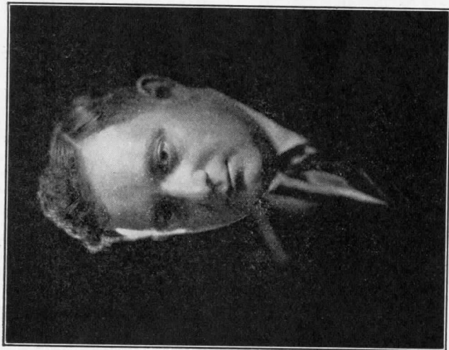
BENJAMIN GITLOW Candidate for Vice-President