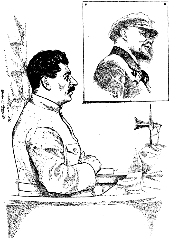
STALIN and LENIN